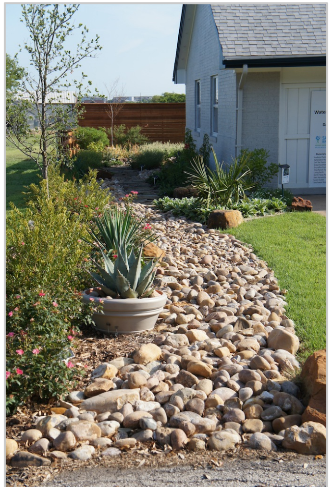
Yard at Texas AgriLife WaterSense Labeled Demonstration Home in Dallas, Texas