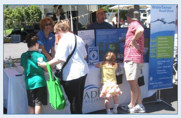
Cascade Water Alliance took WaterSense on the road educating residents about WaterSense and the importance of water efficiency.

Cascade also recognized the importance of educating consumers at the point of purchase and provided free training for retailer staff; issued point-of-purchase materials; and conducted regular, in-store visits, which helped establish strong relationships and encouraged promotion of the