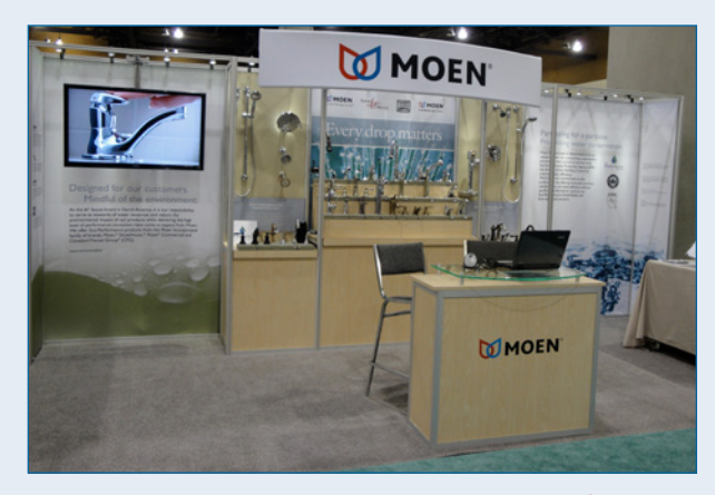
This year, Moen earned the WaterSense label for all of its bathroom faucet models and promoted Water-Sense at trade shows and to national media.

Moen used WaterSense partner materials to promote its WaterSense labeled products and water efficiency on media tours to the Today show and in publications from Good Housekeeping and Elle Décor to Handy Magazine and Fine Homebuilding . Moen