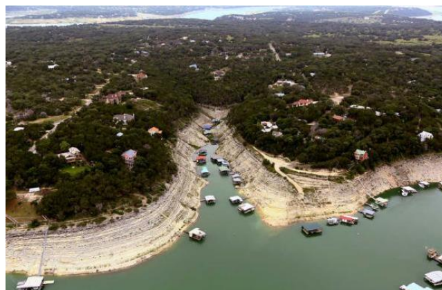
Drought conditions caused water levels in Texas' Lake Travis to decline from 2010 to 2014, as seen in the 2014 photograph above.