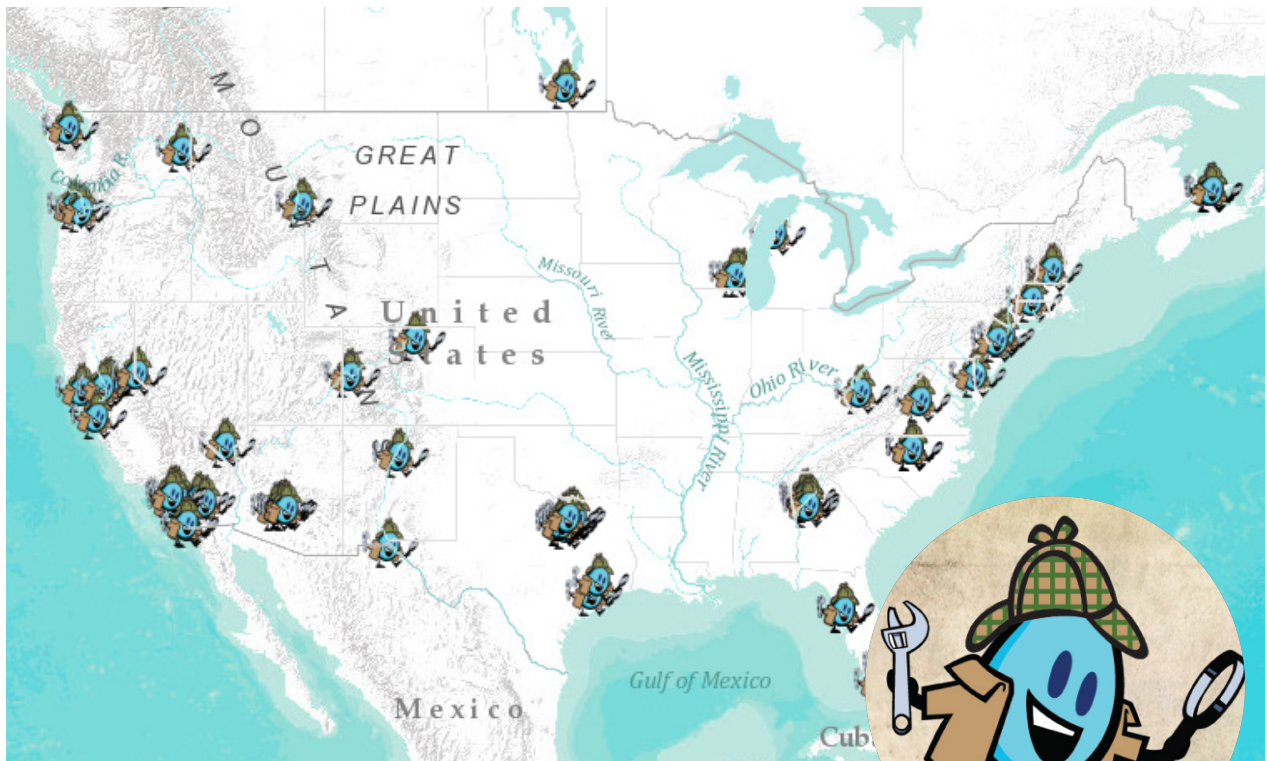
2016 Fix a Leak Week WaterSense event map.

EPA's WaterSense program sponsored the highly anticipated eighth annual Fix a Leak Week (FaLW) March 14 through 20, 2016. The campaign aims to encourage Americans to help put a stop to the more than 1 trillion gallons of water wasted from household leaks each year. Fix a Leak Week is an annual reminder for Americans to check household