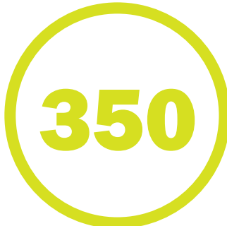
likes generated on Facebook

WaterSense uses Facebook and Twitter social media platforms to promote partner initiatives, water efficiency education, and WaterSense labeled products. The WaterSense Facebook page has more than 12,000 likes, while its Twitter page has more than 17,200 followers. Our Facebook 2016 FaLW event map featured over 60 events in more than 20 states and provinces during the month of March.