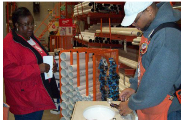
Upper Trinity Water District

Fix a Leak Week workshops were hosted for consumers to learn from experts on how to detect and fix leaks. Various partners worked with The Home Depot and Lowe's .