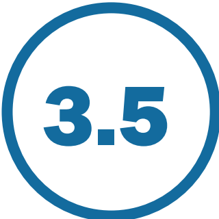
million people reached on Twitter

Our cumulative Twitter tracking efforts showed more than 2,200 people tweeted more than 4,750 times with the #FixALeak hashtag in the days leading up to and throughout FaLW.