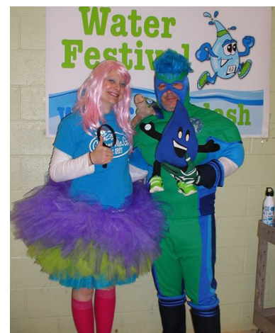
Metropolitan North Georgia Water Planning District

Coachella Valley Water District, CA , hosted an open house event featuring conservation vendor exhibits, leak experts, prize drawings and free leak detection tablets. The City of Santa Fe Water Conservation Office, NM , gave away new toilet flappers to customers who stopped by their office with their water bills.