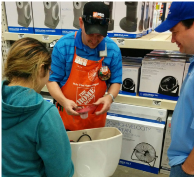
City of Dallas Water Utilities