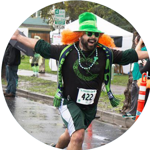
The Santa Rosa Water Department, CA, St. Patrick's Day 5K post-race celebration included a booth for participants to learn about local water saving rebates and tips to reduce water at home.

Many of our partners incorporated a Chasing Leaks theme in their communities by organizing a running race in celebration of Fix a Leak Week.