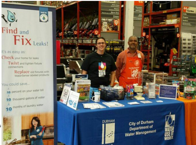
City of Durham Department of Water Management