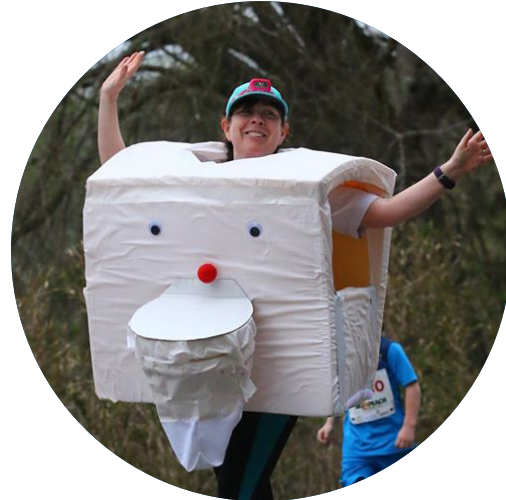
Metropolitan North Georgia Water Planning District, GA, hosted the 4th Annual Water Drop Dash 5K, Kid's Fun Run and Water Festival.