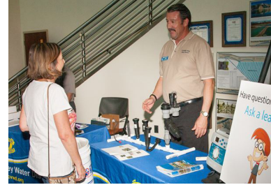
Coachella Valley Water District