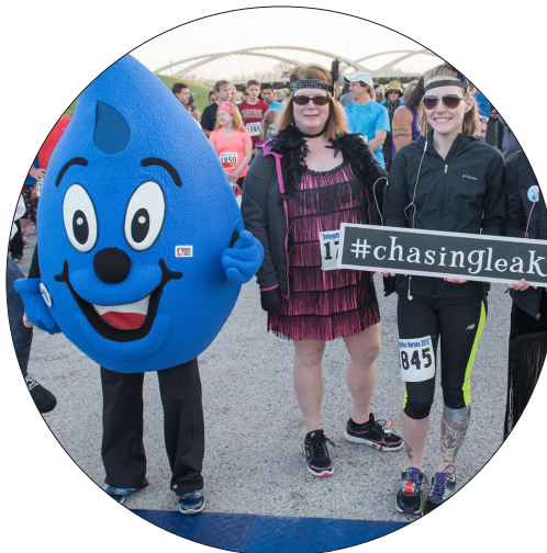
The City of Fort Worth's, TX, Chasing Leaks, Fixing Flappers, 1920's themed 5K featured a costume contest for best dressed flapper along with giveaways and music.