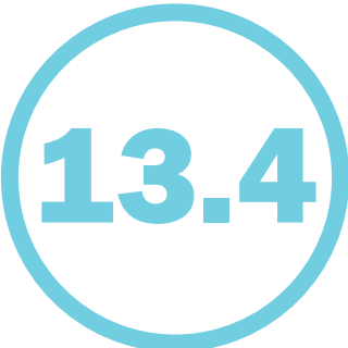
million Twitter impressions