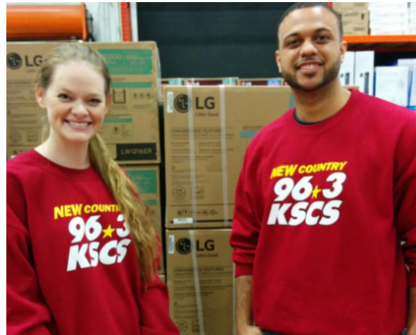
City of Dallas Water Utilities