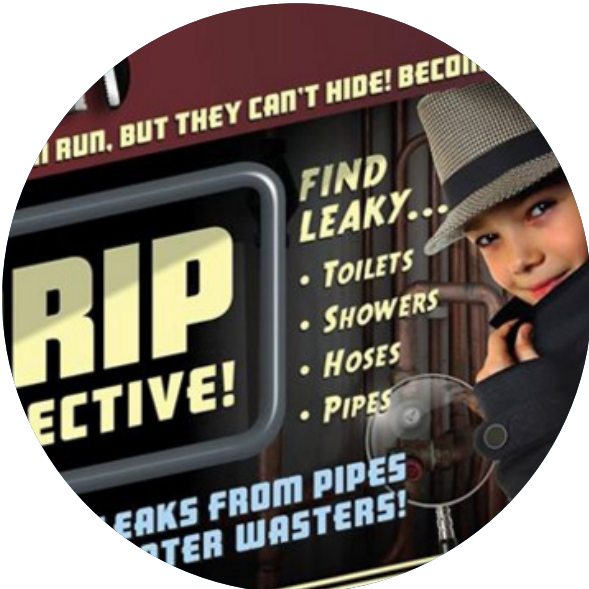
Sonoma County Water Agency

Irvine Ranch Water District, CA, hosted a contest where participants submitted photos of themselves fixing a leak for the chance to win a $100 gift card to The Home Depot.