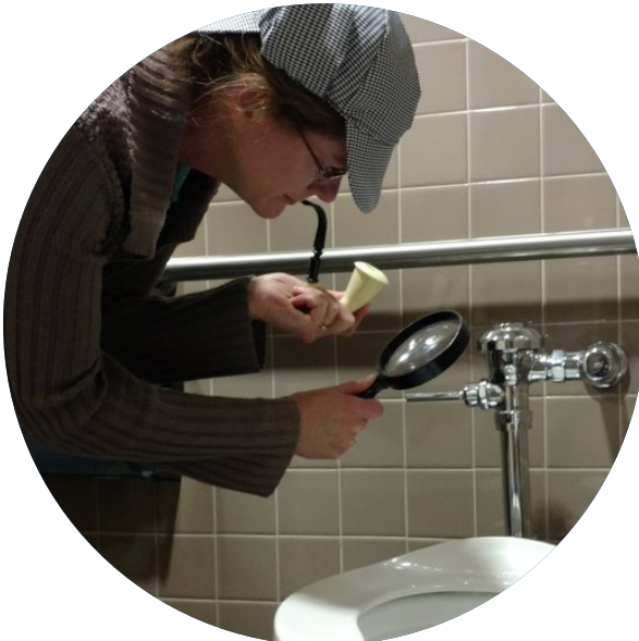
Athens-Clarke County Public Utilities Department