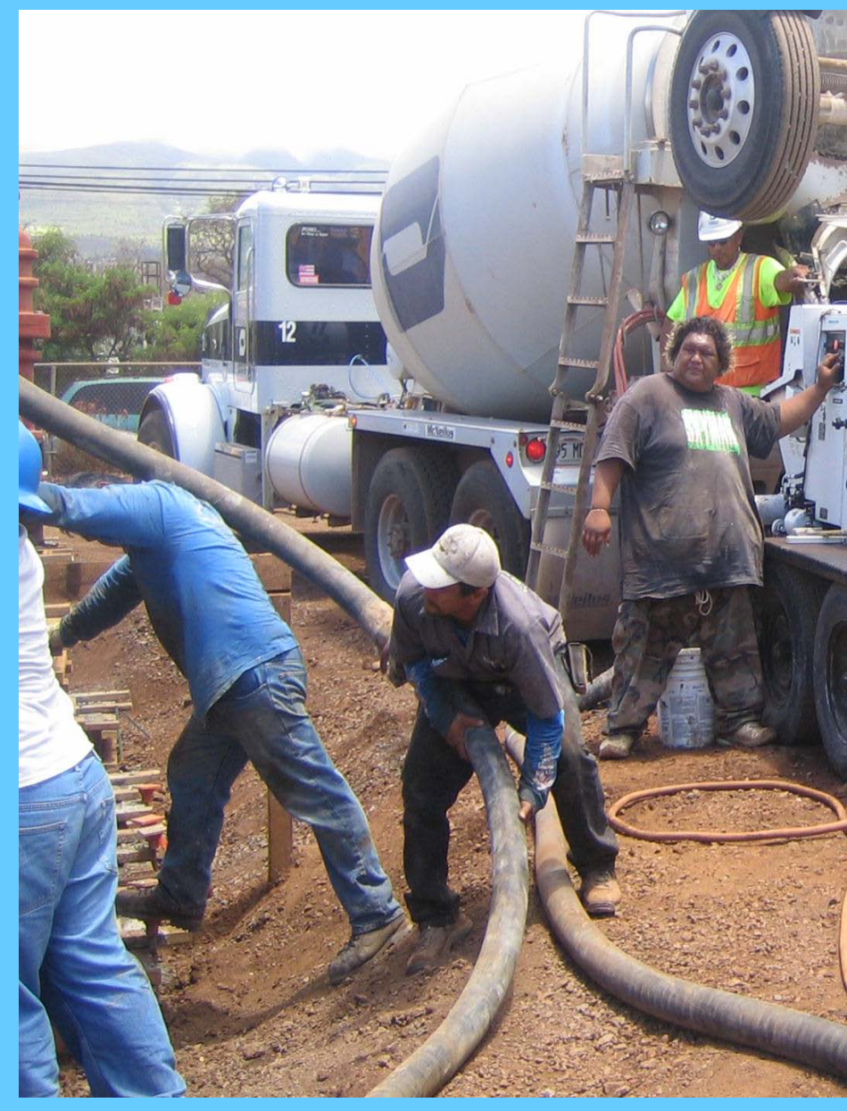
Lahaina Pump Station 1 on Maui