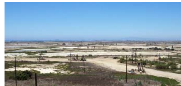
Bolsa Chica Today