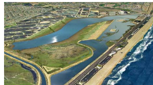
Bolsa Chica Restored

Bolsa Chica State Ecological Reserve Huntington Beach, CA