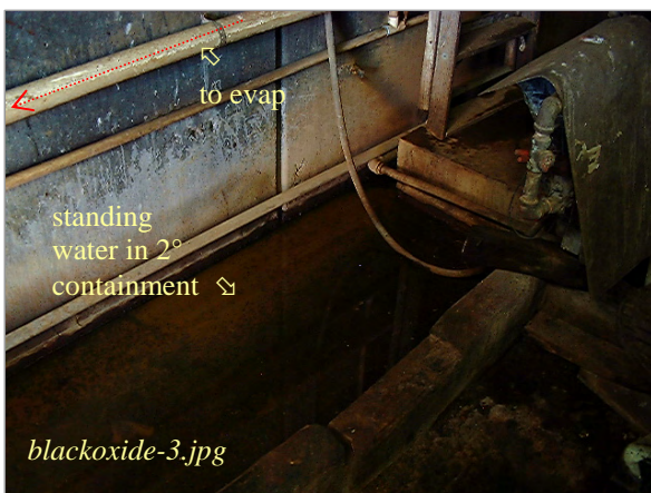
Photo: 2° containment behind black oxide line Date: 05/03/07