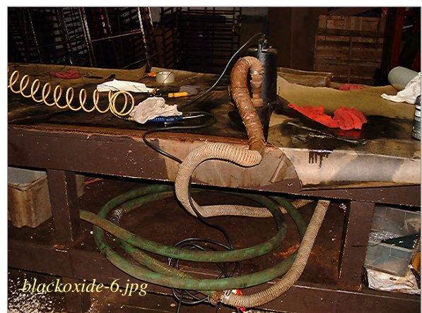
Photo: Portable pump and hose in black oxide room Date: 05/03/07