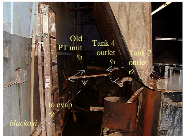
Photo: Hard piping behind black oxide line Date: 05/03/07