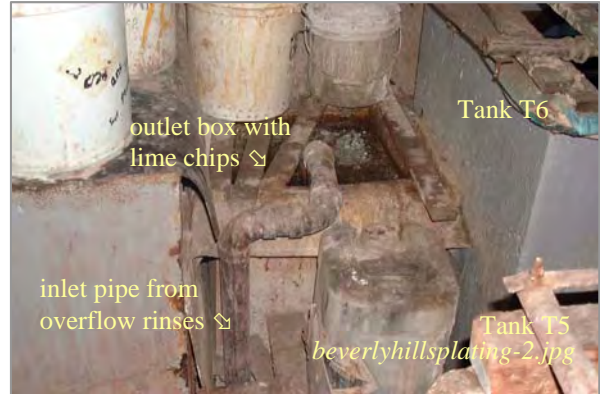
Photo: Sewer Discharge Point Date: 10/09/07