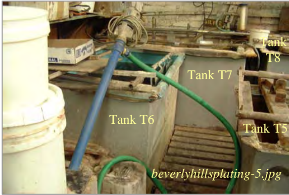
Photo: Solution Transfer Pump and Hose Date: 10/09/07

Four of the nine photographs taken during this inspection are depicted below and saved as beverlyhillsplating-1.jpg through -9.jpg .