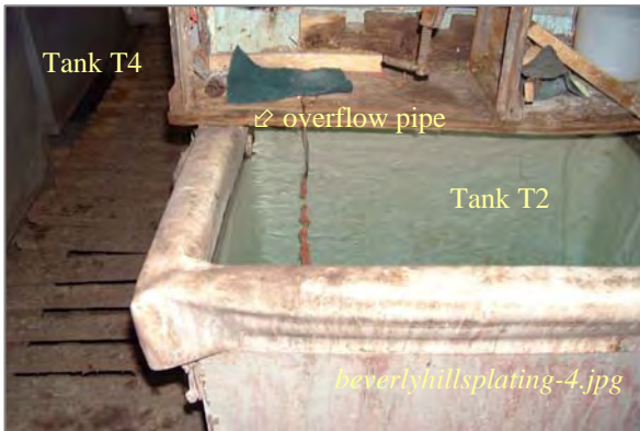
Photo: Tank T2 - Continuous Overflow Rinse Date: 10/09/07