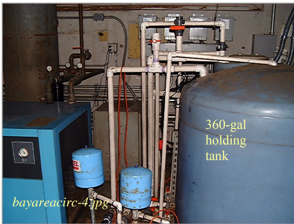
Photo: Cooling Water Delivery for Reuse/Overflow Date: 04/4/06

Arthur took seven digital photos, saved under the file names bayareacirc-1.jpg through bayareacirc-7.jpg . Four are depicted here. The others were duplicates.