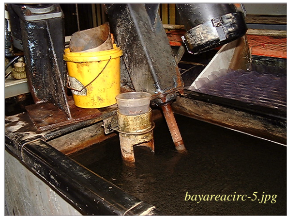
Photo: IWTU – Top of Plate Settling Unit Date: 04/4/06