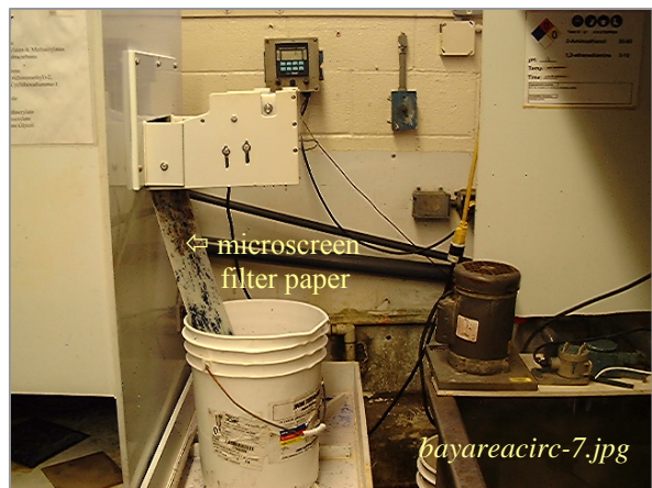
Photo: Photo Resist Strip - Micro-screen Filter Date: 04/4/06