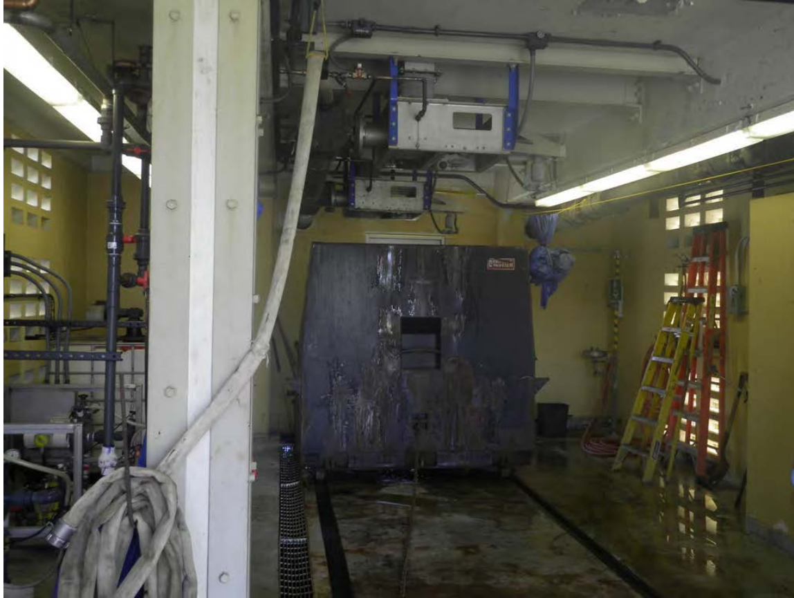
Picture 23: Dumpster for collecting dewatered sludge from centrifuges.