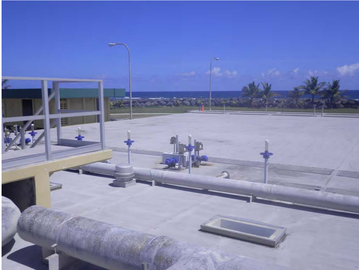
Picture 11: Collection ducts for odor control system at primary clarifiers.