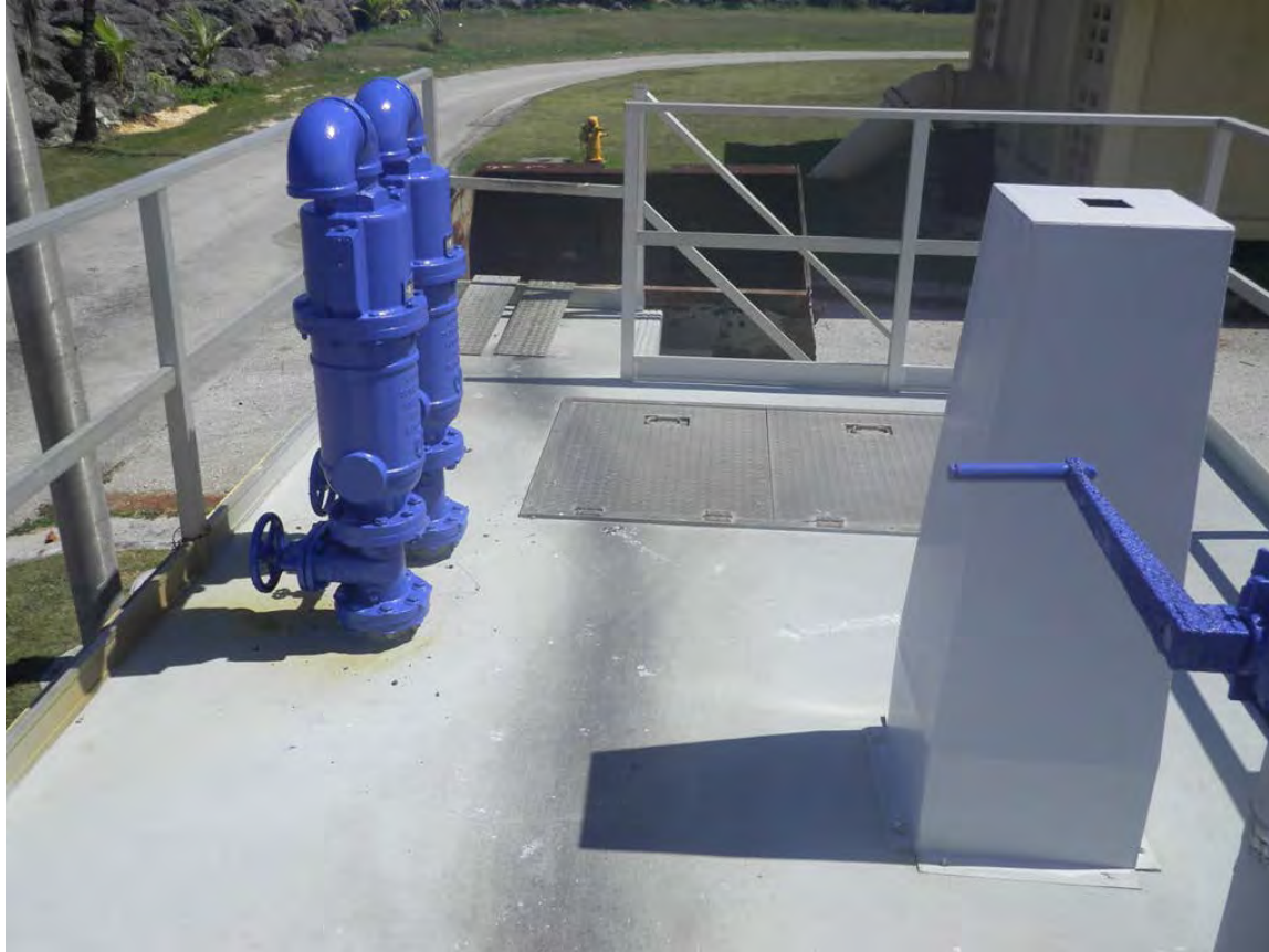
Picture 8: Dumpster used to collect settled solids from grit chamber.