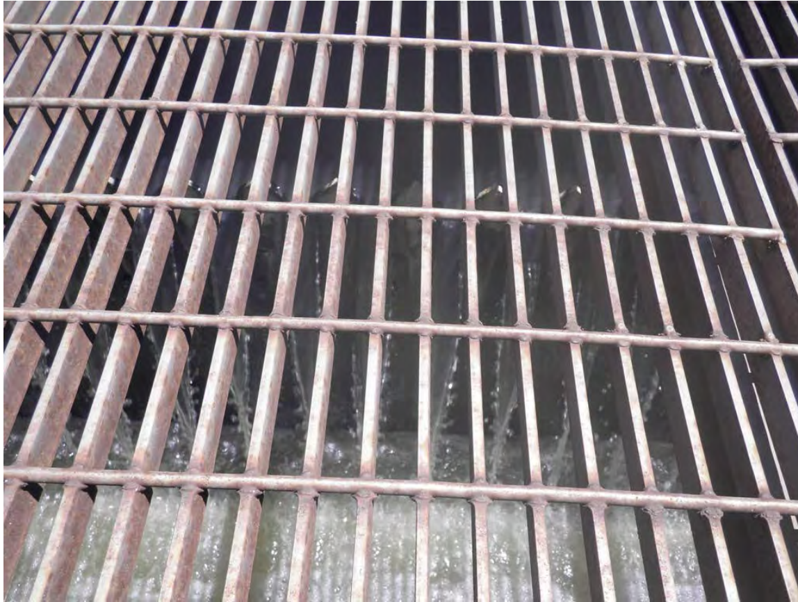
Picture 18: Primary clarifier effluent discharging over v-notch weir.