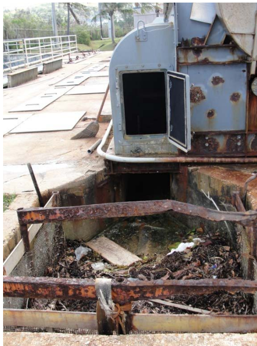
Photo 10: Traveling screen wash water trough and solids collection basin.