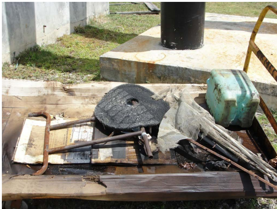
Photo 18: General debris observed stored on-site in a location which is vulnerable to contact with storm water.