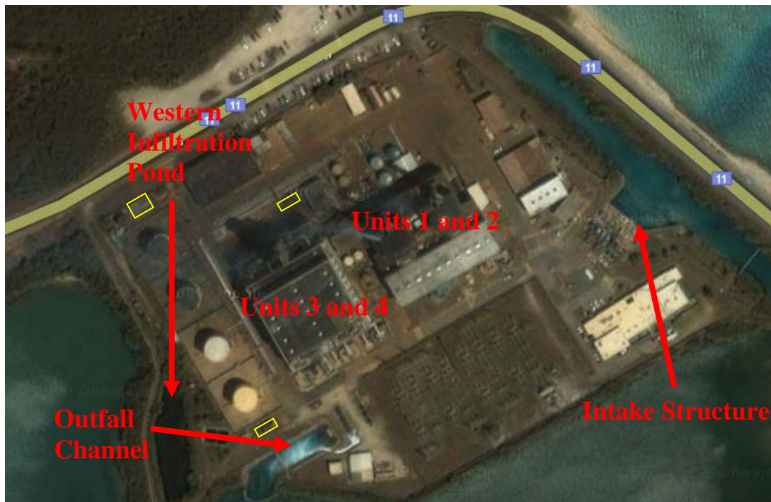
Photo 2: Overview of the Cabras Power Plant from Google Maps, with intake structure, outfall channel, western infiltration pond, and Units 1, 2, 3, and 4 identified. Oil water separators are indicated by yellow boxes, however are not labeled.