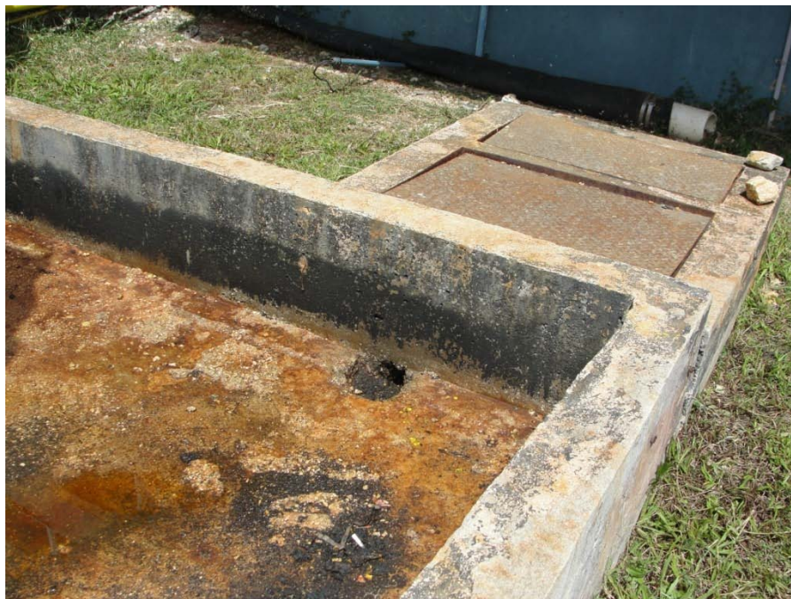
Photo 14: The secondary containment for an oil tank located south of Units 1 and 2 was observed to have a constructed breach.