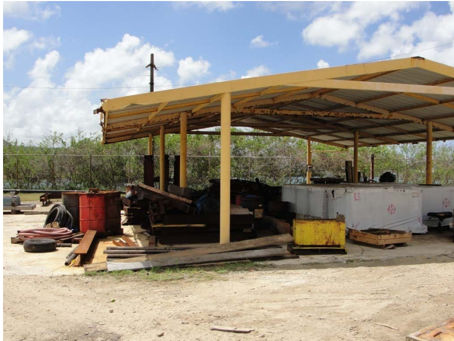
Photo 19: General debris observed stored on-site in a location that is vulnerable to contact with storm water. The items under cover appear to remain vulnerable to storm water contact via storm water flow-through.