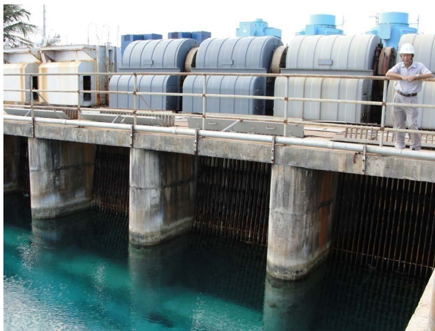
Photo 8: Close up photo of the intake structure for Units 1 and 2.