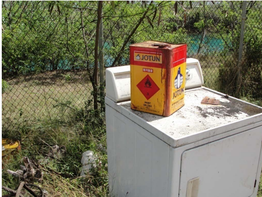
Photo 11: Paint observed incorrectly stored behind the maintenance shop and vulnerable to contact with storm water.