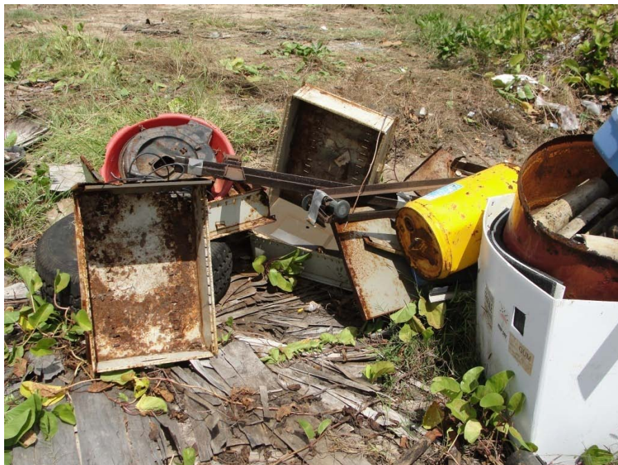
Photo 20: General debris observed stored on-site in a location vulnerable to storm water contact.