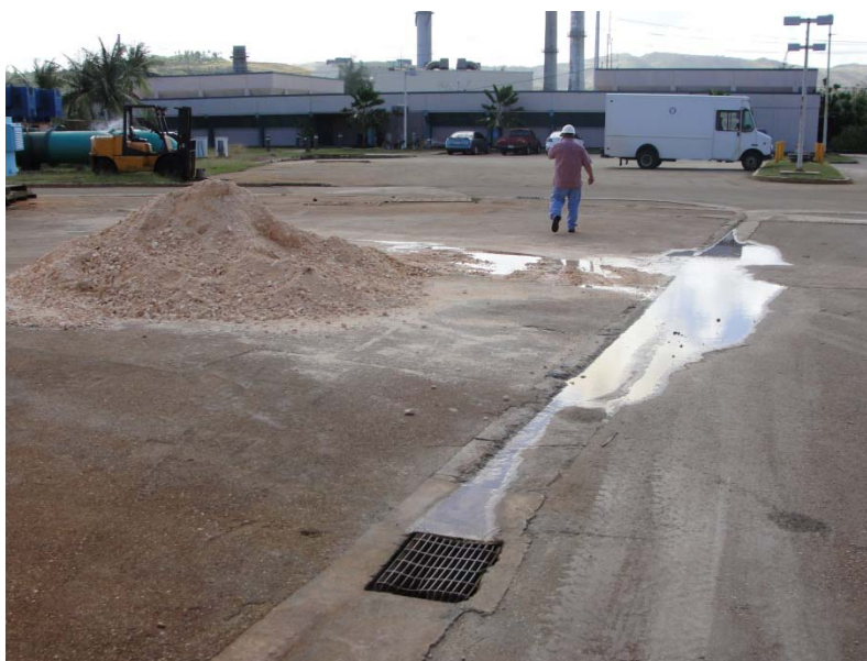
Photo 4: A pipe rupture was observed onsite, resulting in potable water discharging to the storm water collection system, which discharges to Outfall Serial No. 101.