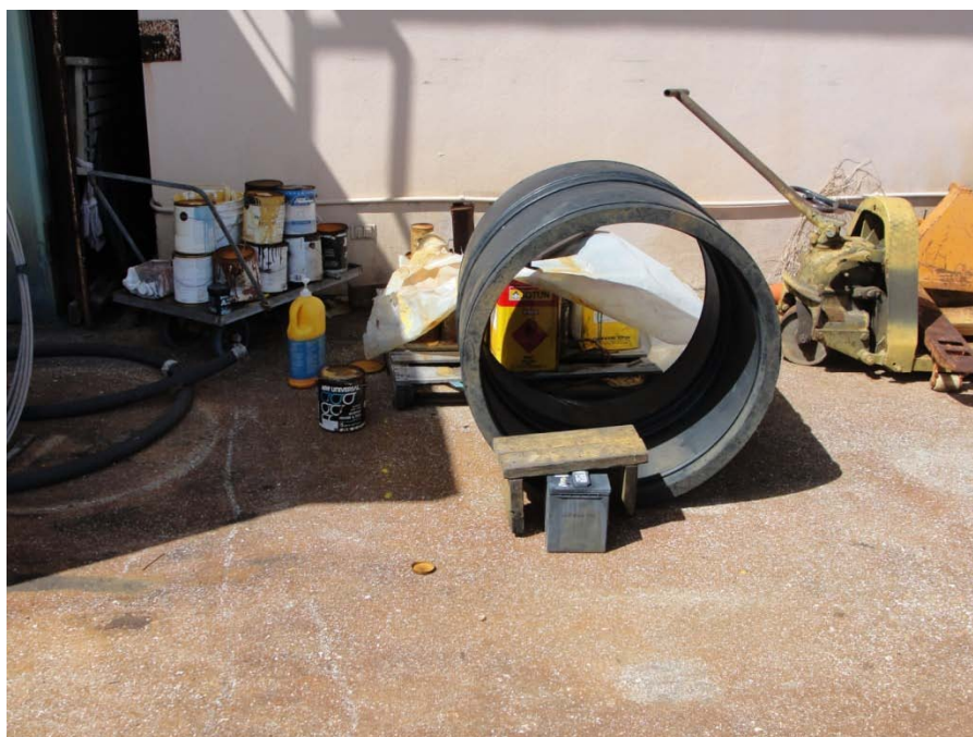
Photo 12: Paint, a vehicle battery, and other debris observed incorrectly stored in a location behind the maintenance shop and vulnerable to contact with storm water.