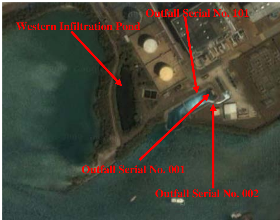
Photo 3: Overview of the Cabras Power Plant from Google Maps, individual outfall locations identified. Note the proximity of the infiltration pond to the receiving water. The inspector is concerned that pollutants from the infiltration pond are migrating to the receiving water.