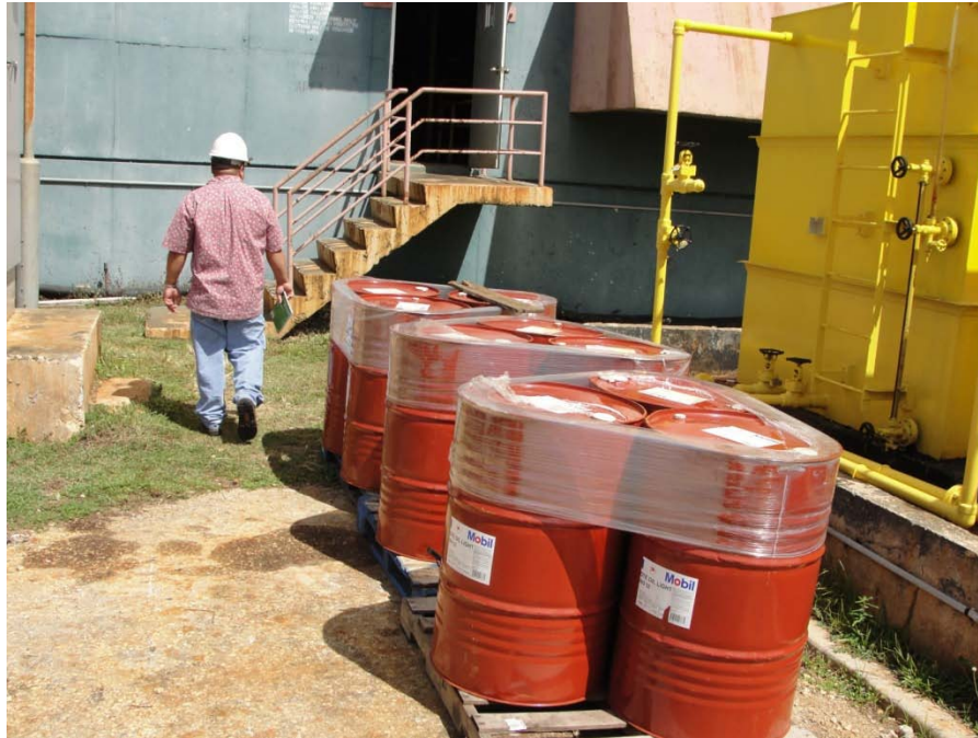
Photo 13: Twelve 55-gallon drums of a petroleum product were observed in the drainage area for Outfall Serial No. 101.