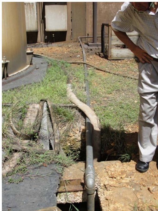
Photo 15: The Discharger was observed pumping out a neutralization tank for their reverse osmosis system (due to an overflow of potable water) into Units 3 and 4 storm water drainage system, which discharges to the infiltration pond.