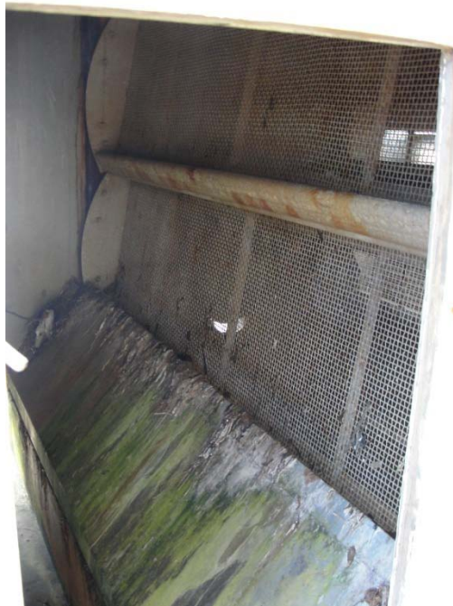
Photo 9: Mesh screen used on the traveling water screens, located just after the bar screens.