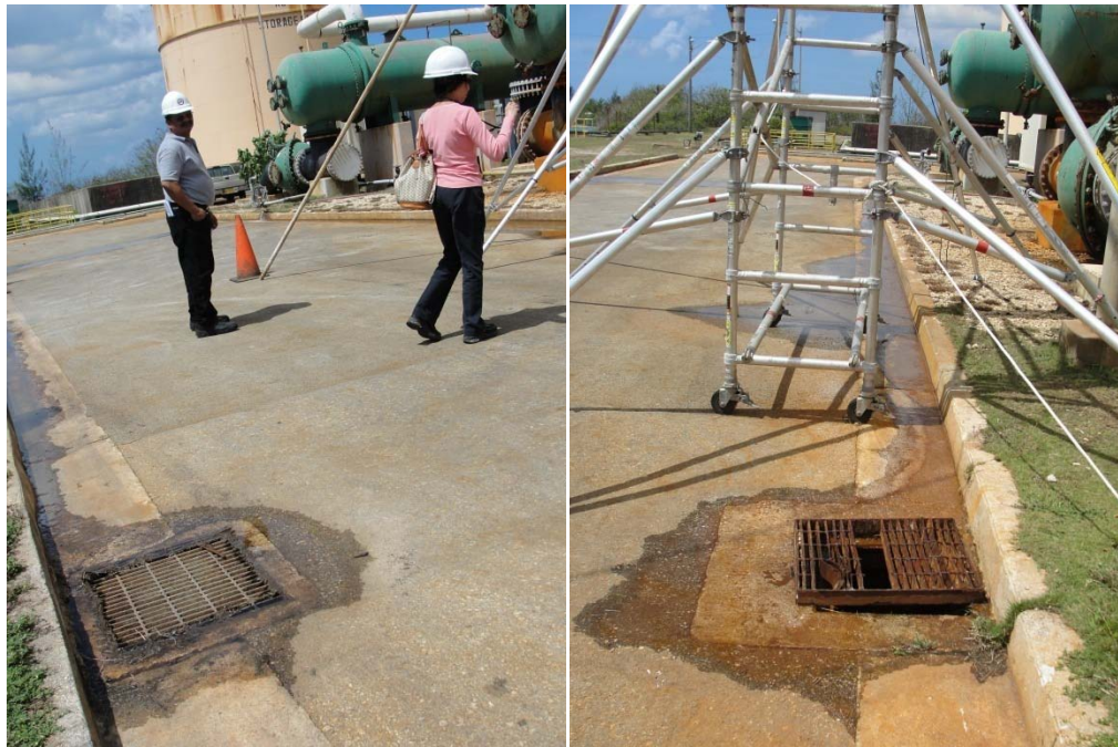
Photo 17: Low temperature cooling water from Units 3 and 4 discharged to the drainage system.