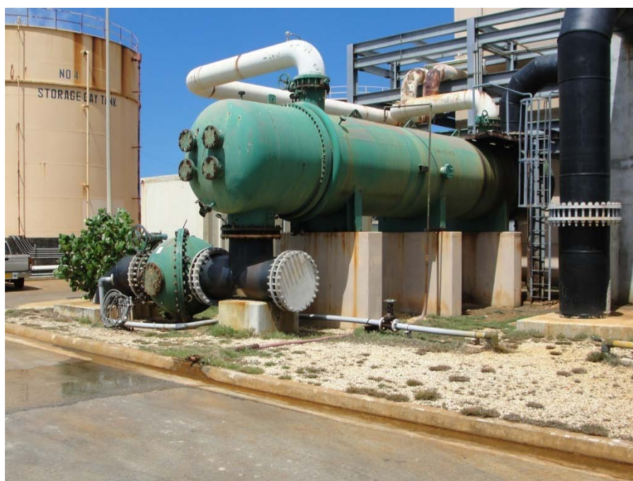
Photo 16: The low temperature cooling system for Units 3 and 4 was observed to be leaking. This area drains to the Units 3 and 4 drainage system, which discharges to the infiltration pond. However, during heavy rain events, this cooling water may be washed further down the service road and enter the drainage area for Outfall Serial No. 101.