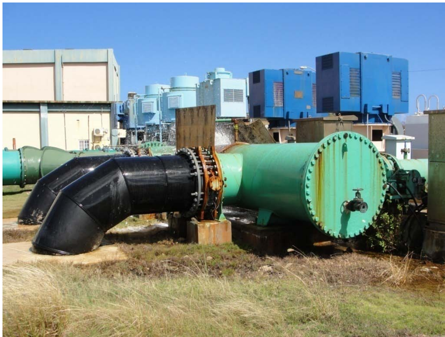
Photo 5: The intake manifold for Units 3 and 4 was leaking intake cooling water.