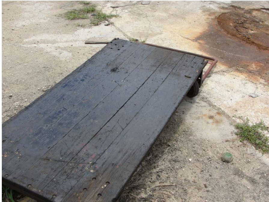
Photo 21: An oil soaked dolly, observed on-site in a location vulnerable to storm water contact.