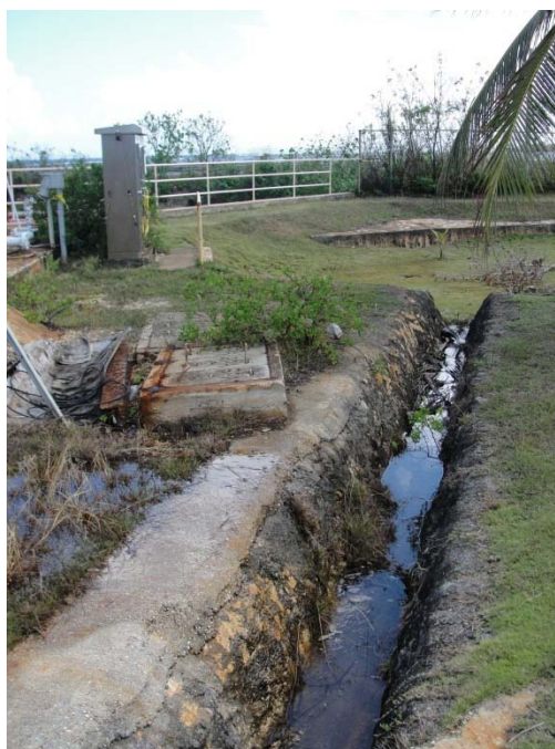
Photo 6: The intake cooling water leaking from the intake manifold was observed draining to the eastern infiltration pond, adjacent to the Piti Channel and intake structure.