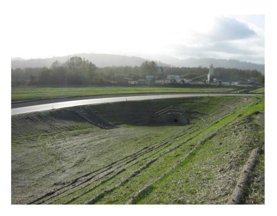
Photograph 2. Alton Interchange Project – Combination of multiple erosion and sediment controls