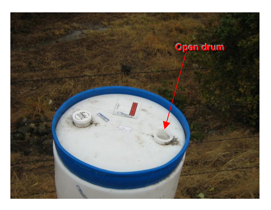
Photograph 3. District 2 Red Bluff Slab Project – Open drum of detergent along the highway storm water conveyance system. (Note: Drum appeared empty, possibly due to the missing bung)