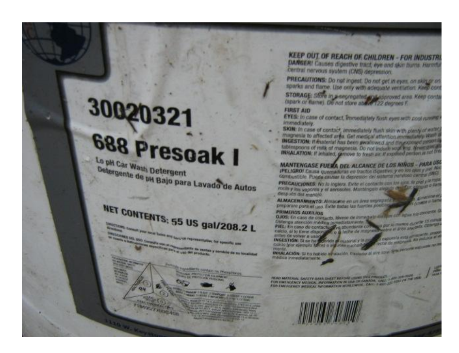
Photograph 4. District 2 Red Bluff Slab Project – Close-up view of drum label corresponding to Photograph 3