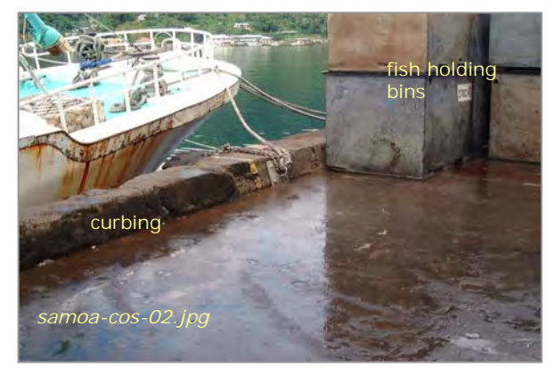
Photo #1: Harbor Dock - Shows Curbing / Washdown

Nine of the 11 digital photographs taken during this inspection and one of 21 taken from Starkist are depicted here in this section. The COS Samoa photographs are saved as samoacos-01.jpg through -11.jpg . The Starkist photograph is saved as samoa-starkist-14.jpg .