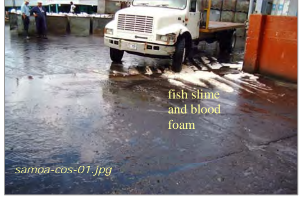
Photo #2: Harbor Dock - Fish Slime from Thawing