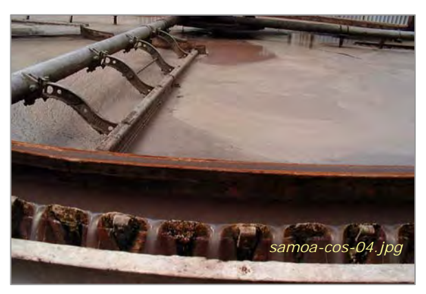
Photo #3: Low-Strength Wastewater - DAF Unit