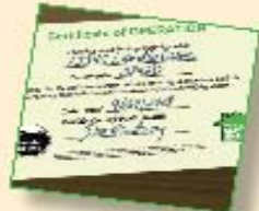
Your approval certificate can be a great selling point.

Over the years we've gotten smart about the impact of septic systems in Boulder County. There is clear evidence that aging, unapproved septic systems are leaking into our water system. This is bad news for our health and for the environment. New regulations, effective September 1, 2008, in Boulder County will protect our health and environment.