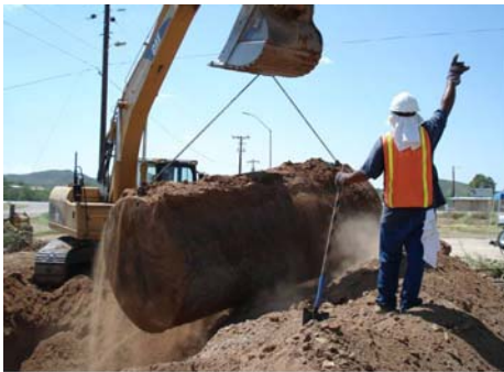
An Underground Storage Tank being lifted from the ground

Since its launch in 2005, EPA's Indian Country LUST Corrective Action Initiative continues to make significant progress. A team of scientists, engineers and attorneys has worked closely with six tribes to select 22 abandoned LUST sites on tribal lands in EPA's Pacific Southwest Region for site assessment, cleanup and closure activities. To date, EPA has closed out 15 sites and spent over $2.5 million of the Federal LUST Trust Fund.