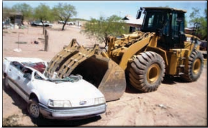
Vehicle collection by the Tohono O'odham Nation. The Tribe owns the equipment to collect the vehicle from where it was abandoned and transport it to a centralized storage area.