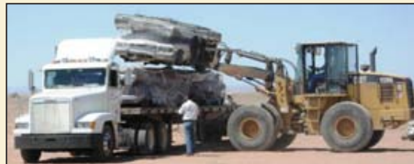
Stacked on a transport vehicle