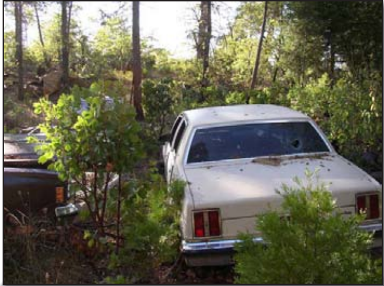
Abandoned vehicle on tribal land

To initiate a successful program, the tribal government should work closely with the community and provide information on the environmental, health, and other hazards associated with abandoned vehicles.