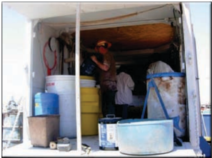
Fluid collection at the Hopi Tribe. The tribe subcontracts all activities to prepare the vehicles for crushing. Fluids are removed from the vehicle and placed into secondary containers. Anti-freeze and oil are recycled. Mercury switches are handled and disposed of as hazardous waste. Gasoline is disposed of by an environmental waste management service.