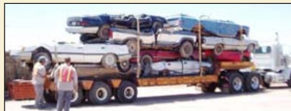
Vehicles being transported to the metals recycler/purchaser