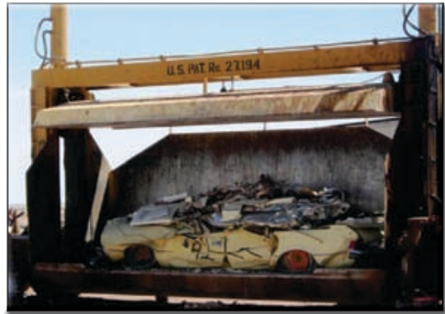
Vehicle crushing by the Hopi Tribe. The crusher is contracted by the Tribe and arrives to crush vehicles collected in a centralized location. To reduce cleanup needs crushing should take place over drip pads or other absorbent material.