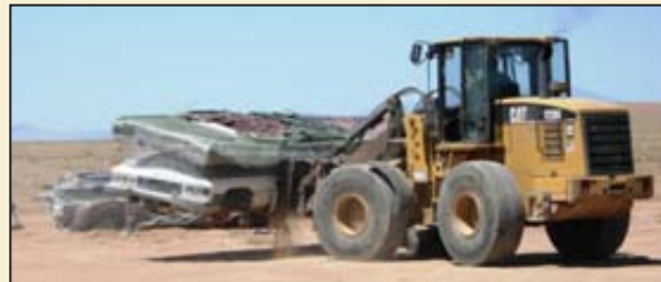
Vehicles are sorted