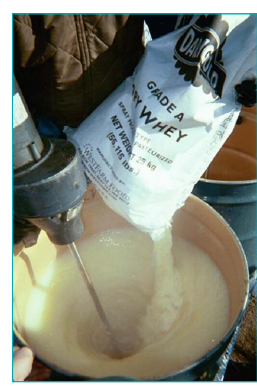
Mixing Cheese Whey and Molasses.

on its obligation to address the contamination, U.S. EPA would use the money set aside as financial assurance to complete the cleanup.