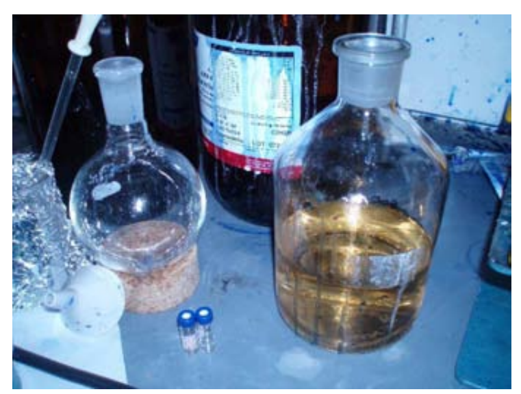
Photo 2: open, unlabeled, unidentified container of yellow/ brown liquid under lab's fume hood

- There was an open, unlabeled container of a yellow/brown liquid under the lab fume hood (Photo 2). The lab manager could not identify the container's contents;