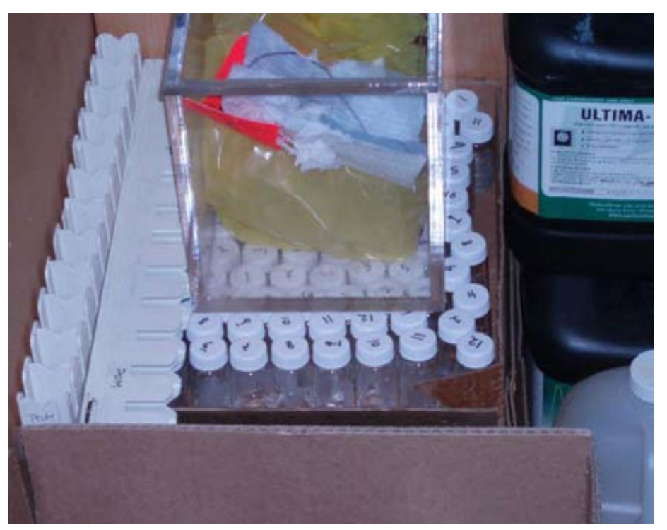
Photo 4: unlabeled, discarded scintillation vials still containing scintillation liquid

- Unlabeled discarded scintillation vials, partially filled with liquid (Photo 4). Discarded scintillation liquid is a mixed waste (both hazardous and radioactive);