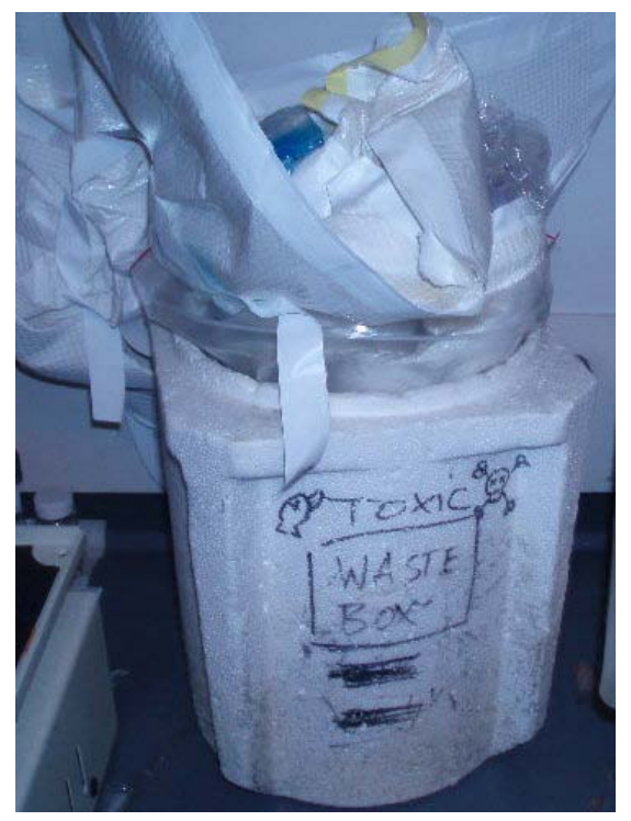
Photo 7: open, unlabeled, overflowing styrofoam hazardous waste container

- One unlabeled 1-gallon brown bottle (Photo 8);