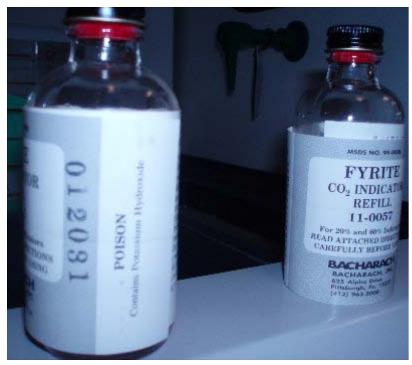
Photo 19: unlabeled bottles of discarded potassium hydroxide in the Wiencke Lab