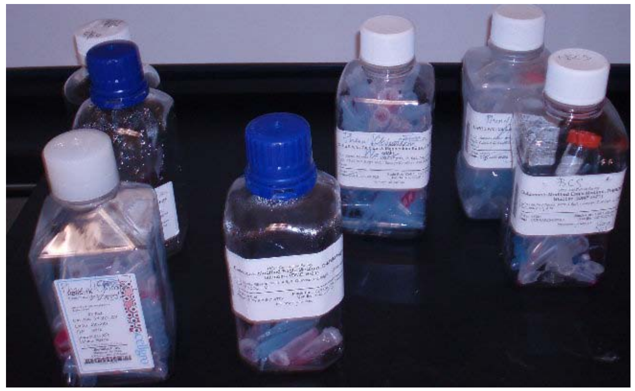
Photo 18: six unlabeled bottles of waste phenol chloroform in the Long-Cheng Li Lab