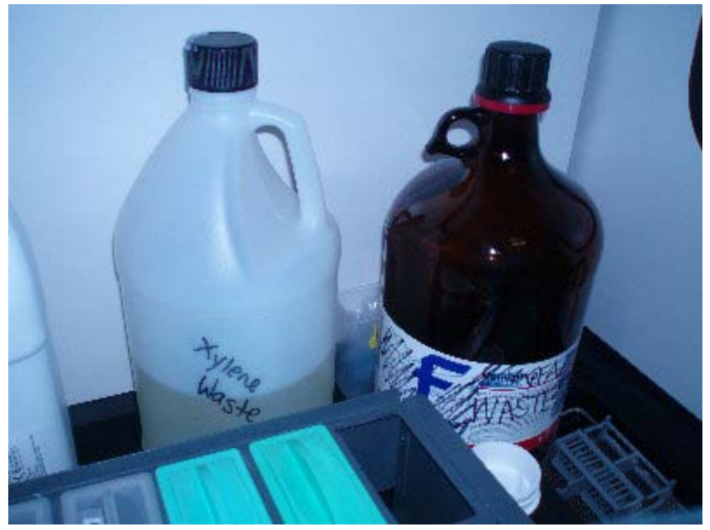
Photo 17: incompletely labeled containers identified as "xylene waste" and "FA waste" in the McMahon Lab.

The inspectors noted that a 1-gallon container identified as "xylene waste" and a 1-gallon container identified as "FA waste" were insufficiently labeled (Photo 17).