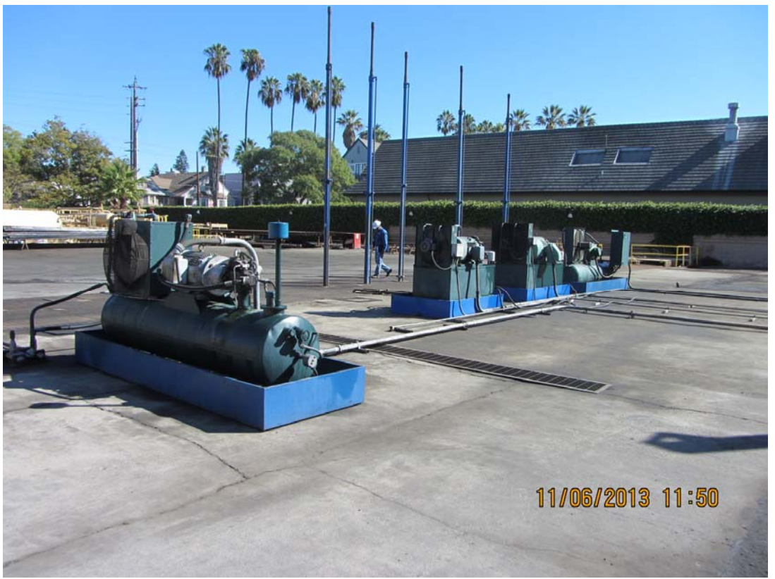
Photo No. 6 Time: 1051 Direction Photo Taken: S Photo Description: HYDRAULIC OIL TANKS IN SECONDRY CONTAINMENT – TANK AT RIGHT IN USE

Photo No. 5 Time: 1050 Direction Photo Taken: E Photo Description: AREA ABOVE WELL GALLERY