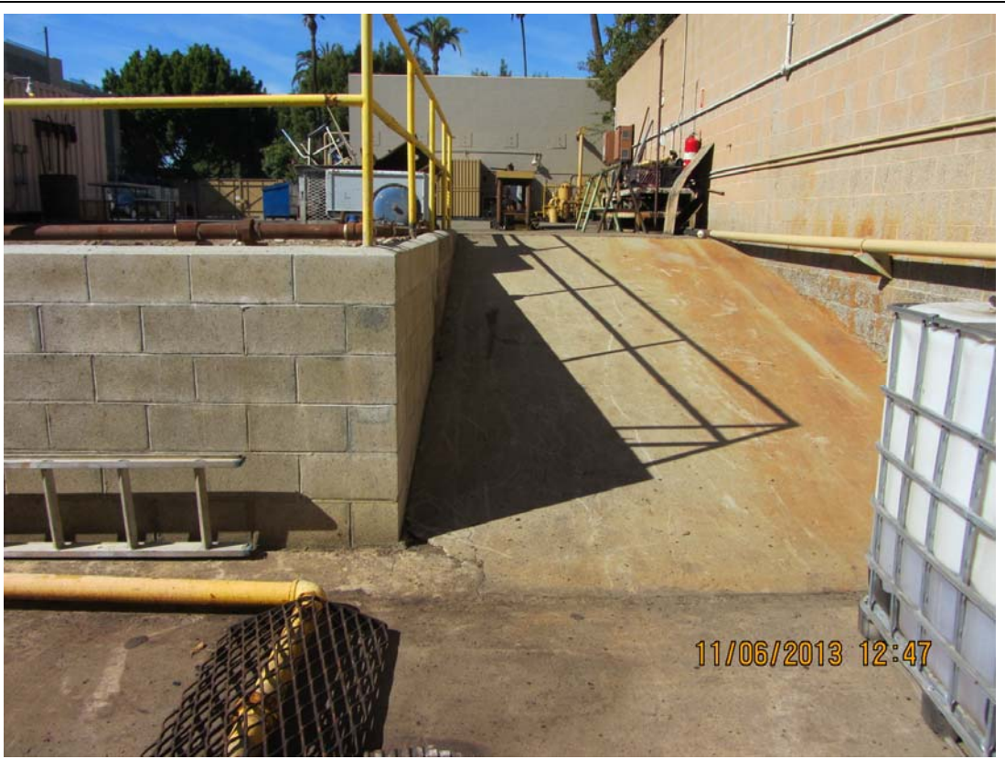
Photo No. 32 Time: 1149 Direction Photo Taken: S Photo Description: VIEW OF PAVEMENT IN AREA SHOWING EXCESSIVELY DARK IN GOOGLE MAP IMAGE – SEE END OF PHOTOLOG

Photo No. 31 Time: 1147 Direction Photo Taken: NW Photo Description: RAMP AT TANK FARM CONTAINMENT AREA; PIPING PROTECTED FROM VEHICLES BY METAL GUARDS