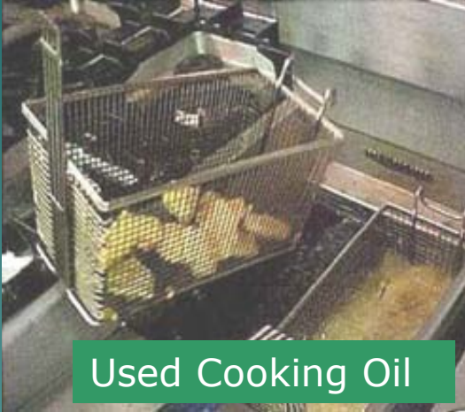
Used Cooking Oil