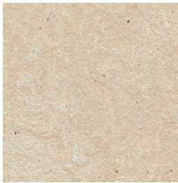
Lightly marbled texture