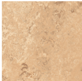
Vibrant colors with texture