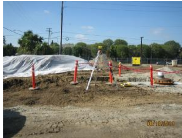
Overview of Montrose property looking at treatment pad area (6/19/2013) Trench and Survey Equipment at DelAmo and Vermont (6/19/2013)