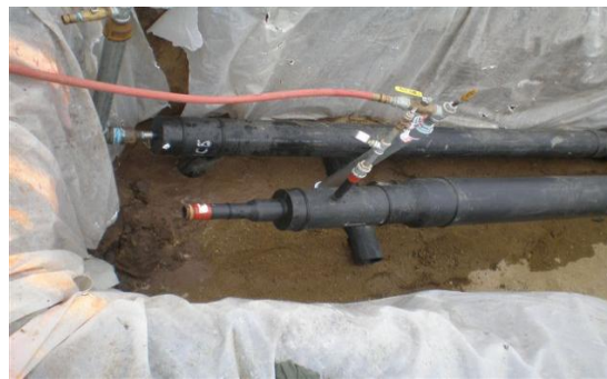
Pressure Test of Pipeline (4/23/2013)