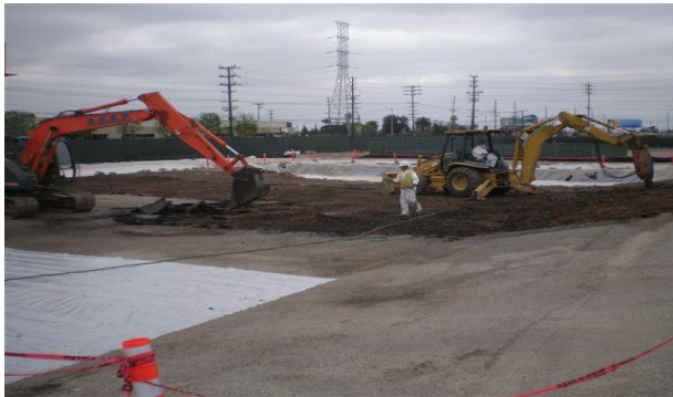
Removing asphalt at treatment pad (4/24/2013)

The injection and extraction pipelines on the Montrose property were installed and successfully leak-tested this past month. The two extraction wells located on Montrose were completed and tested. Approximately, one-third of the excavation preparing the treatment plant foundation has been completed. The two re-injection wells located at Del Amo Ave. and Vermont Ave. have been installed. EPA conducted a total of eight work inspections and found all work was conforming to approved design, and good construction practices were being used. There were no exceedances of noise levels outside the Montrose property. The dust monitoring was comprehensive and, with one exception, was in compliance with project requirements. There was one hour during the past month where there were a few dust level exceedances; however, modifications were made to the dust control measures, and the dust monitoring results returned to within project standards. EPA collected dust samples which are currently being analyzed for DDT.