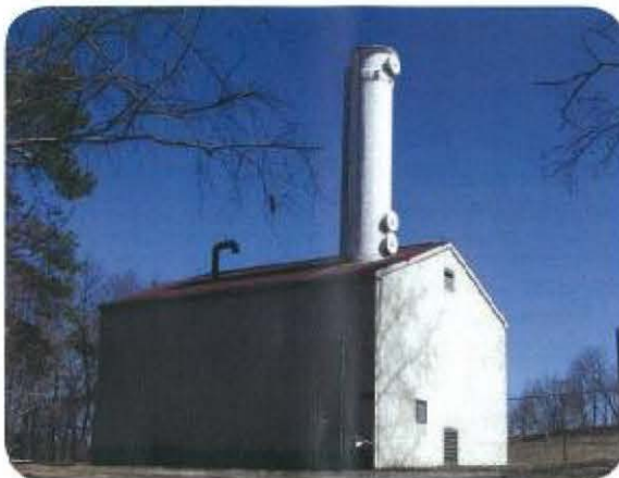
Air stripper and treatment building

Installation of the air stripper and treatment equipment may require use of heavy machinery, especially at large contaminated sites. Area neighborhoods may experience some increased truck traffic as the equipment is delivered. Large tanks or columns may be visible from the street and may need to operate for many years. However, care is taken to make sure the operation of air strippers is as quiet as possible.