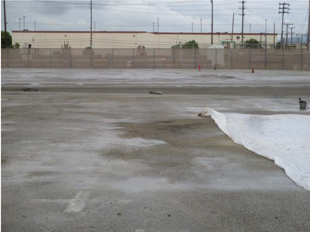
Figure 3: Pavement areas sprayed with water to control dust. No dust observed.