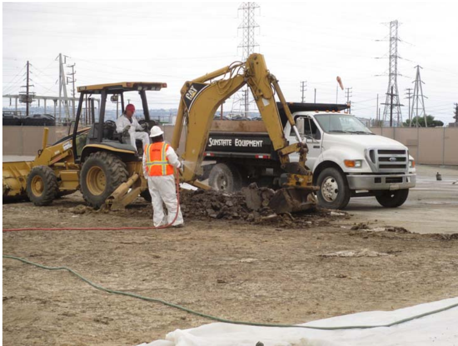
Figure 2: Worker spraying water for dust control on soil material being removed from stockpile and loaded into dump truck for use as fill. No dust observed.