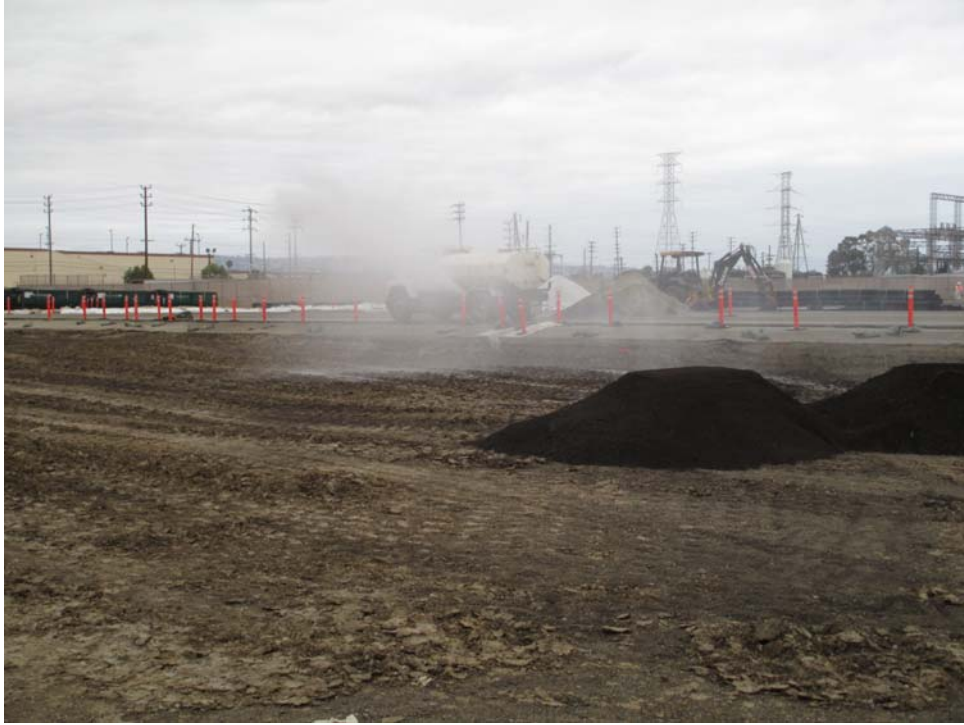
Figure 1: Water truck spraying fill pad to keep the soils conditioned for placement as engineered fill and for dust control. No dust observed.