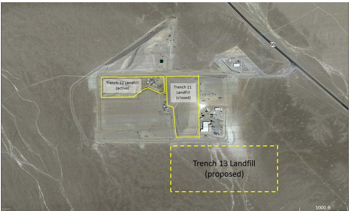
US Ecology Nevada Facility – Aerial Photograph

Operation and maintenance requirements in the Draft RCRA Permit also contain provisions for: waste analysis for proper management of hazardous waste; contingency plan and preparedness requirements to prevent and respond to hazardous waste spills or accidents; personnel training requirements; inspection and record-keeping requirements; and unit-specific closure requirements. USEN is also required to conduct corrective action due to historical releases of hazardous chemicals at the facility. USEN has already initiated corrective action at these sites. In the Draft RCRA Permit, these sites are referred to as Solid Waste Management Units (SWMUs).