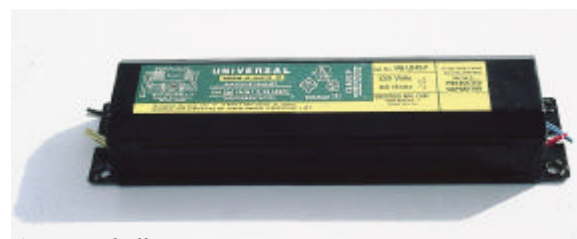
An intact ballast.

fluorescent tubes is critical. Because the ballasts contain PCBs and the fluorescent tubes contain mercury, the waste ballasts and tubes from a lighting retrofit should be handled as hazardous waste.