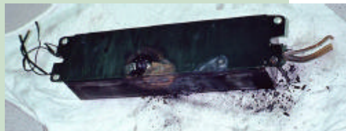
This ballast sparked a fire at a Southern California school in 1999.

Postponing a lighting retrofit and betting on the structural integrity of old ballasts is a dangerous gamble with serious health and educational impacts for your students and staff and serious cost impacts for your budget.