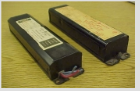
Flourescent light ballasts

The primary PCB waste processed by LRI is fluorescent light ballasts, shown above. The ballasts are disassembled into scrap metal and wire and PCB waste. The scrap metal and wire are sold to recy-