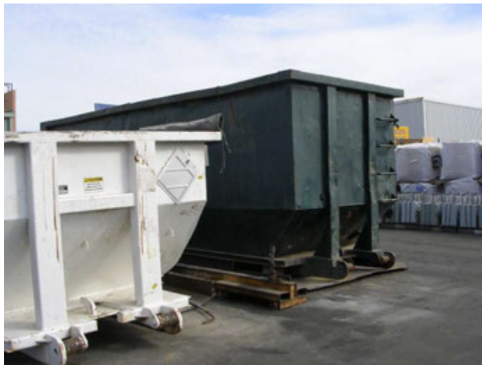
Roll-off bins staged in the outdoor storage yard