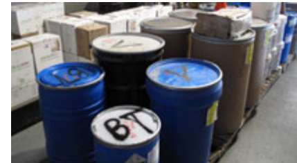
Drums in PCB storage area

PCBs are not known to occur naturally. They are man-made organic chemicals that were manufactured from 1929 until their manufacture was banned by EPA in 1979. PCBs range in consistency from crystalline to solids to sticky resins.