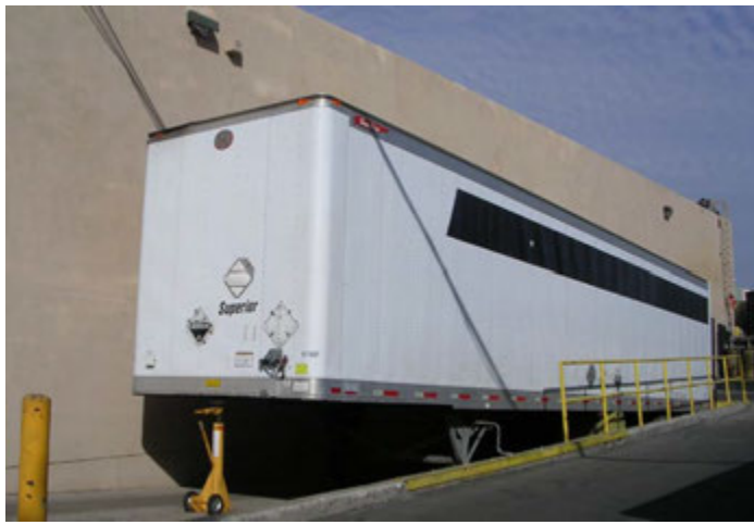
Truck staged in the truck-bay for PCB equipment and material unloading