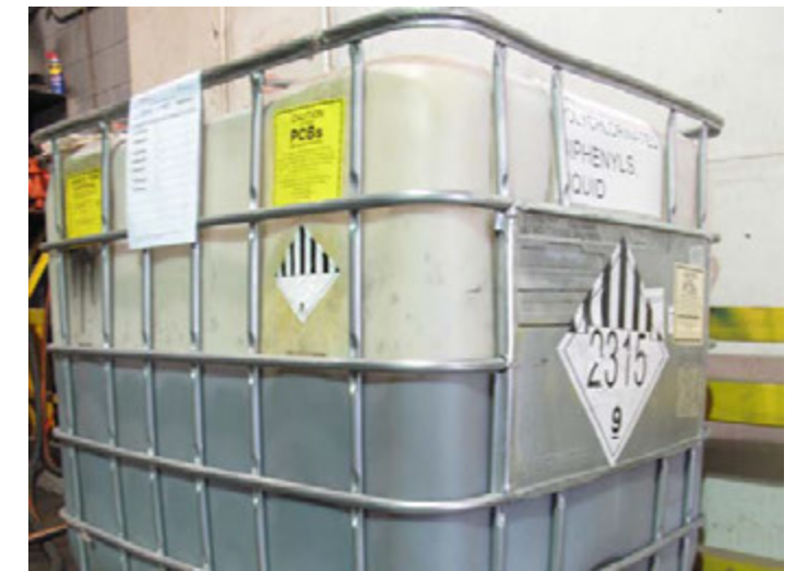
Tote containing PCB liquid

PCBs are a class of toxic chemicals that are cancer-causing and may cause harmful effects on the body. Once released into the environment, PCBs can last for decades.