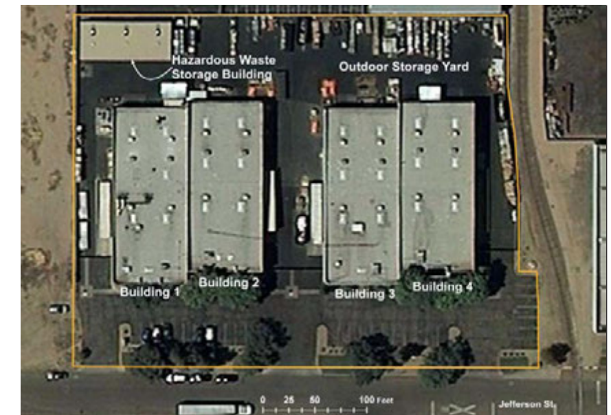
Aerial View of Facility