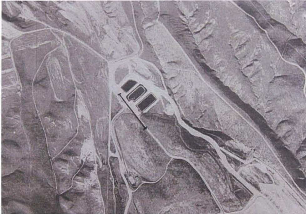
Figure 1. PID Survey Line, Ponds 14, 15, 16.