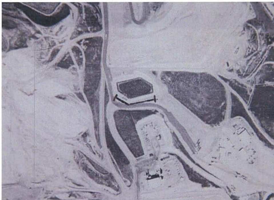
Figure 3. PID Survey Line, Pond 9.