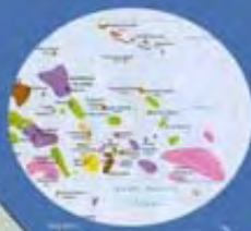
Map of the Pacific Islands region.