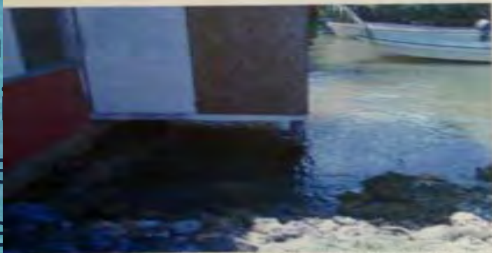
(resident whose foundation is wholly covered by salt water)