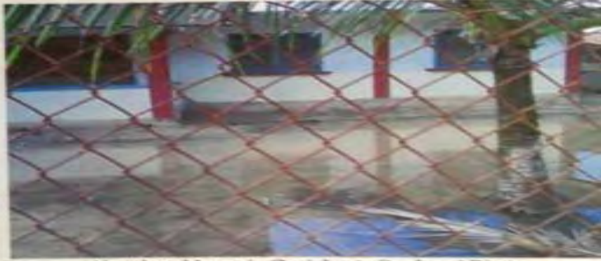
(Abandoned home in Onoi due to Sea Level Rise)