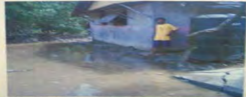
(Resident losing its leverage from salt water intrusion, Patta)