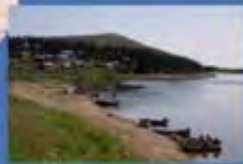
Photograph of a coastal landscape with a beach and buildings.

This project, supported by the National Oceanic and Atmospheric Administration (NOAA), aims to use modern communication technologies to open a dialogue among tribal and indigenous decision-makers and resource managers from Alaska, the US Southwest, and the Pacific Islands as well as climate scientists from these regions.