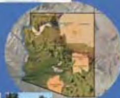
Photograph of a landscape with water and vegetation.