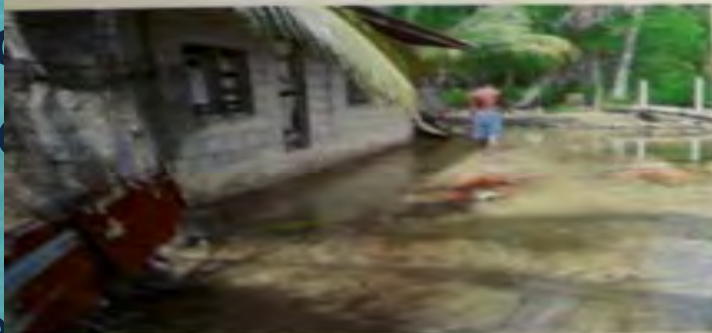
(Complete house from Salt water intrusion, Onoi)