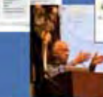
Photograph of a person speaking at a video conference.