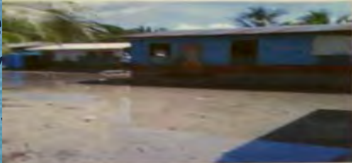
(Homes under sea water, Patta)