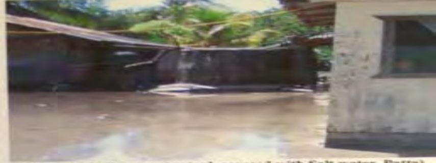
(Homes including a water tank covered with Salt water, Patta)