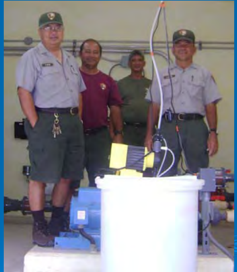
American Memorial Park Staff