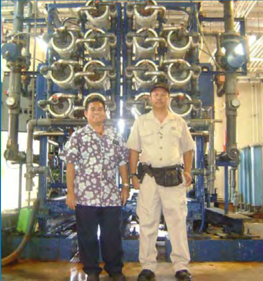
Hyatt Water Operators w/ RO