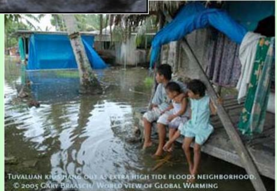
TUVALUAN KIDS PLAYING OUT AS EXTRA HIGH TIDE FLOODS NEIGHBORHOOD.