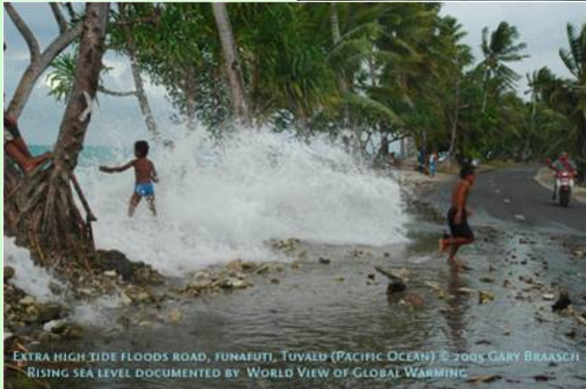
EXTRA HIGH TIDE FLOODS ROAD, FUNAFUTI, TUVALU (PACIFIC OCEAN)