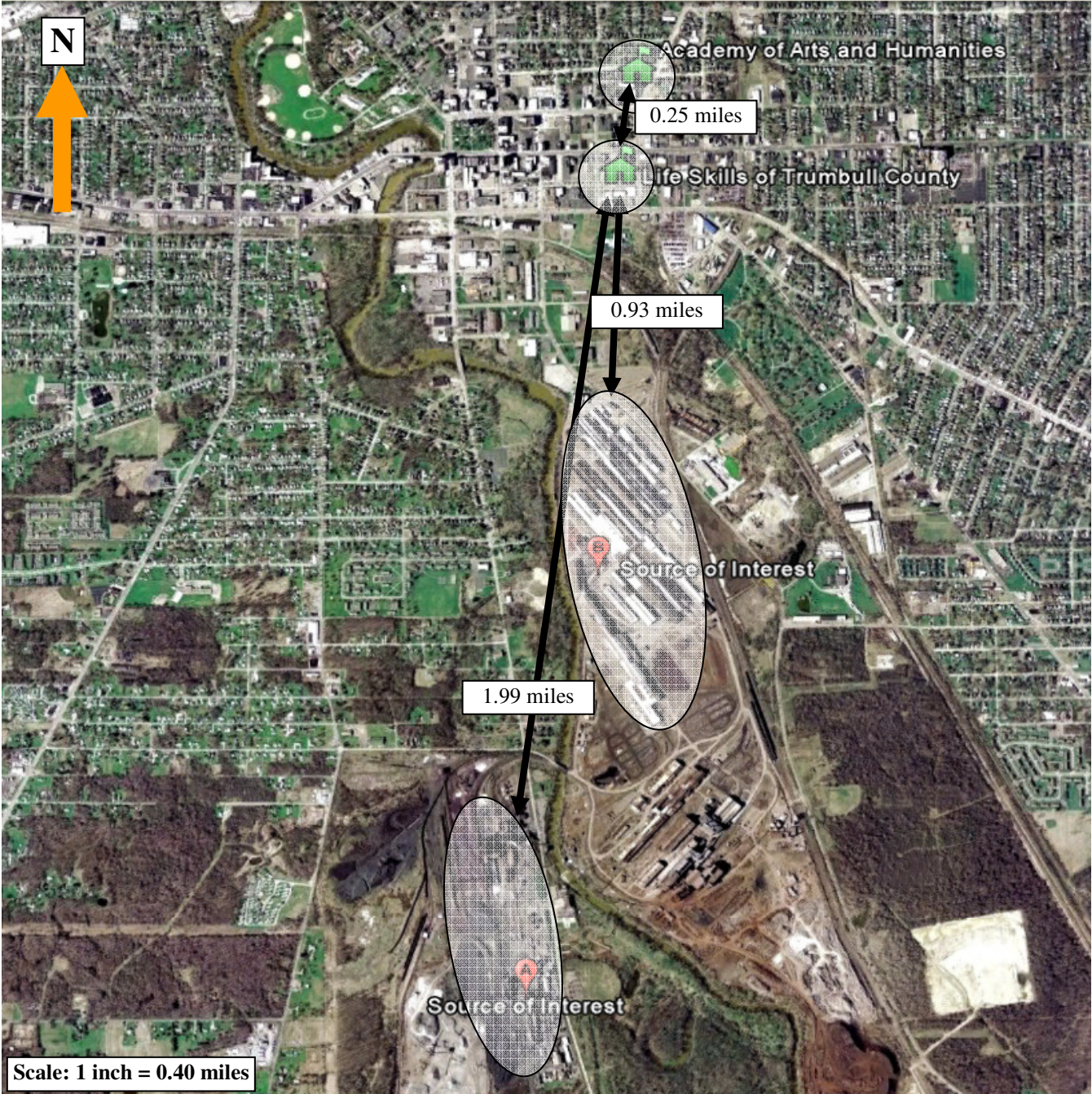
Figure 1. Life Skills of Trumbull County, Academy of Arts and Humanities, and the Sources of Interest.