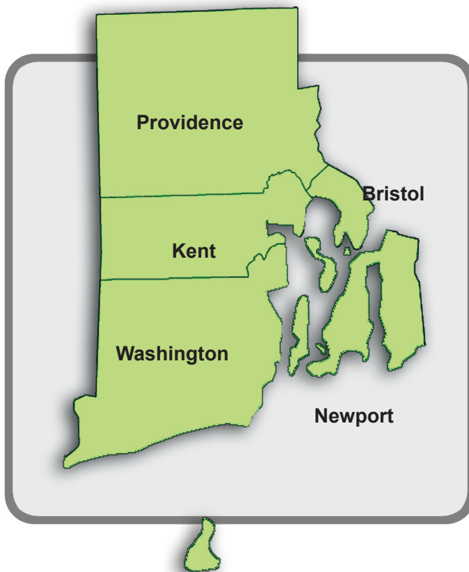
Table 1. Breakdown of monitored and unmonitored coastal beaches by county for 2009.