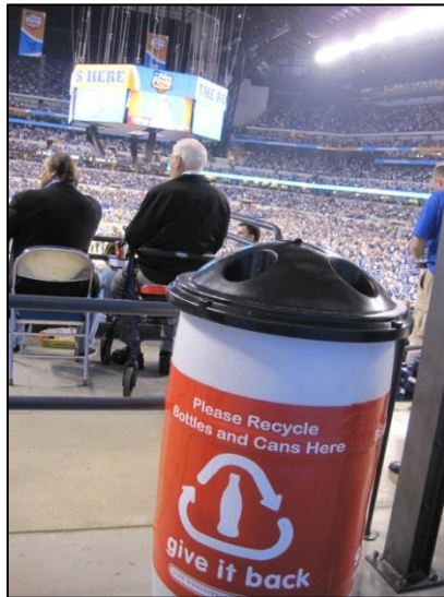
Recycling bin in sports arena.

Events held at sports venues 1 generate significant quantities of recyclable materials from a variety of different facility operations. Many of these materials can be collected and stored on-site for pick up relatively easily and inexpensively. Other materials can be more difficult to recycle and may require additional effort, space and cost to manage.