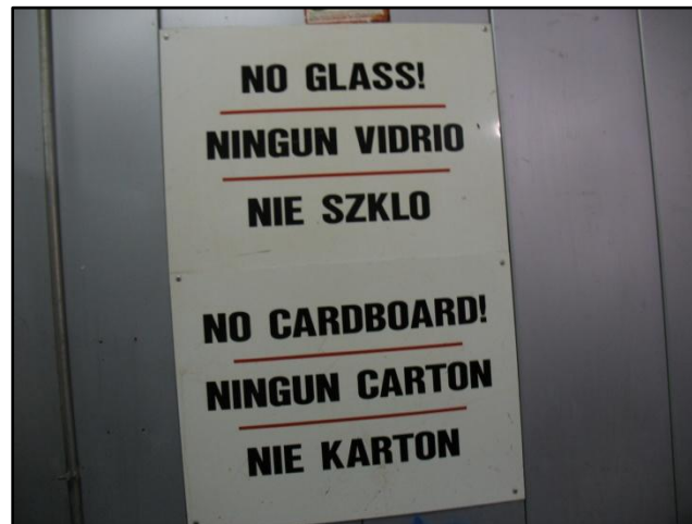
Multi-lingual sign adjacent to waste compactor prohibiting recyclables.