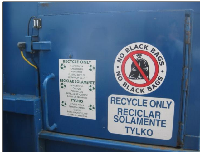
Multi-lingual recycling signage placed on compactor door.

In addition, loading dock staff must be aware that recyclables must be handled, stored and placed in different containers for pick up. This may involve a change in established procedures or the need for additional time required to do the same job. It is important that all operational shifts are aware of recycling procedures. As many crews are bi-lingual, it is important that training, signage and instructions are developed in additional languages. Finally, ongoing training and reminders (such as posters in equipment closets or break areas) should be provided to ensure that recycling procedures are implemented and maintained.