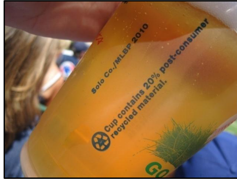
Beer cup made from post-consumer recycled materials.

companies can exist only if consumers purchase products made from recycled feedstock. As large purchasers and consumers of products such as paper, plastic and construction materials, sports venues are in a unique position to support markets for recycled content products. Only when a recycled product is purchased is the “recycling loop” completed.