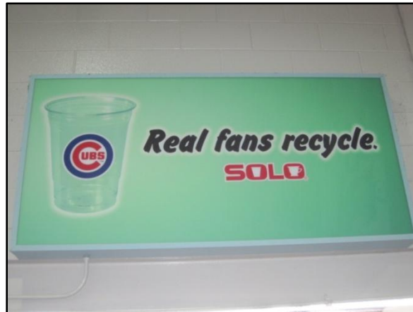
Concourse signage promoting recycling.

by offering tickets in exchange for a specified number of recyclable cups collected, which can be collected and redeemed for prizes. Whatever approach is used, sharing the credit is important to maintain support and enthusiasm for the recycling program.