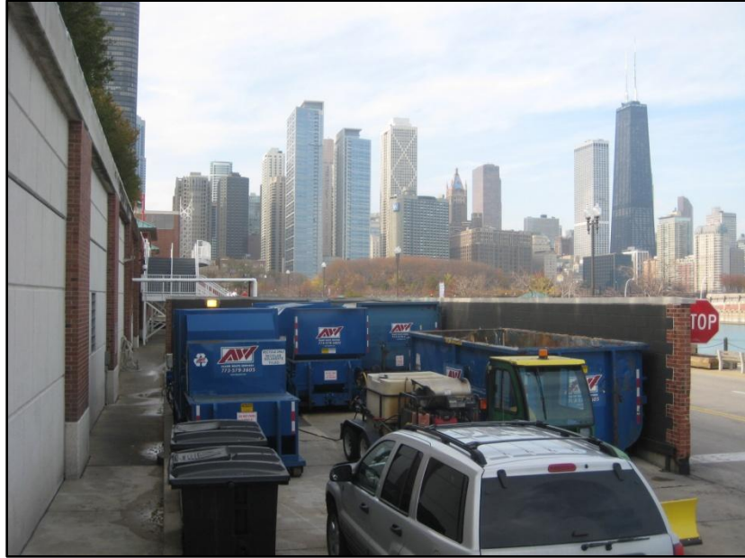
Loading dock area with multiple, separate compactors for waste and recyclables.