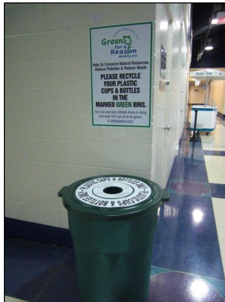
Recycling bin with clear signage indicating acceptable materials.

Finally, many fans expect recycling containers to be available, and are willing to put extra effort into placing recyclables in their proper place. Successful programs involve creative and consistent outreach and education so that fans are aware of the availability of recycling containers as well as what items should or should not be placed in them.