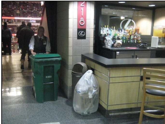
Bartender setting out a bin filled with glass bottles at end of shift.