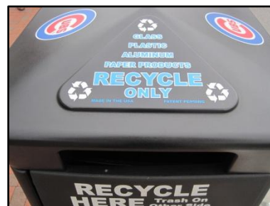
Dual use bin with recycling on one side and trash on the other.

Once recycling bins and signage is in place, additional advertisement such as signage at concession stands, printed messages on recyclable cups increases fan exposure to the message. In addition, promotion of the program through use of a recycling mascot, or give-a-ways such as t-shirts, ball caps or towels can help. Some teams create incentives