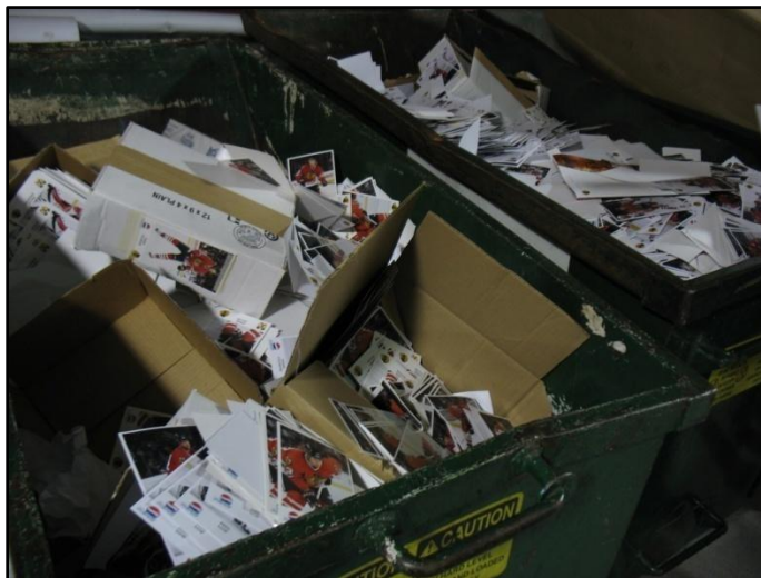
Outdated programs and promotional printed materials staged for pick-up.