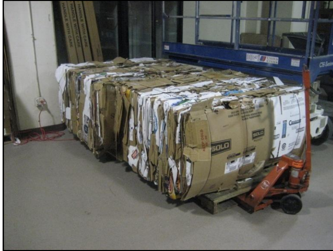
Cardboard bales staged for pickup in loading dock.