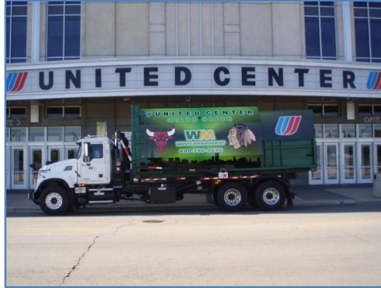
Waste hauler-provided compactor with team logos to promote recycling effort.