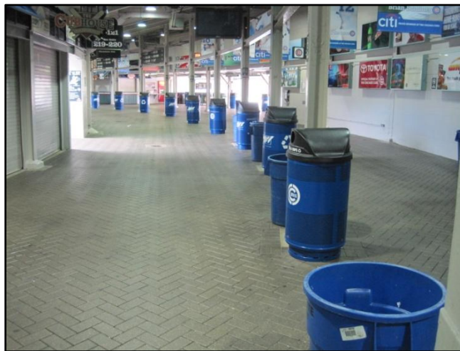
Recycling bins co-located with trash cans on concourse.

The selection of recycling bins is important from the perspective of maximizing participation, convenience and maintaining aesthetics. The following considerations should be taken into account in selecting bins for public spaces in the venue. Bins in administrative offices, kitchens or other employee work areas require different considerations than bins for patrons who are not at the venue on a daily basis. A 'Recycling Bin Selection Guide' can be found in Appendix B.