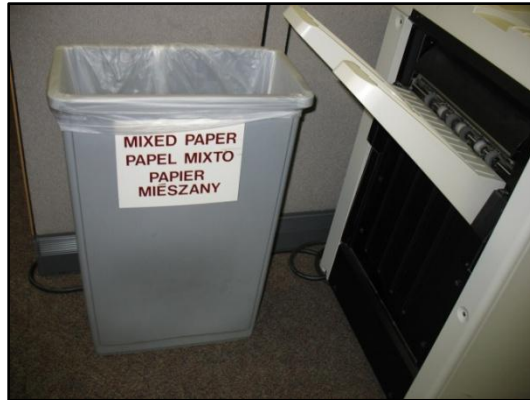
Paper recycling bin adjacent to copy machine.

Office recycling efforts can be reinforced with announcements or articles in newsletters, reminders or progress reports on opening webpage, and posters in common areas such as break rooms or copy rooms. Many offices have established policies to reduce waste by requiring double sided copying, which can significantly reduce paper costs.