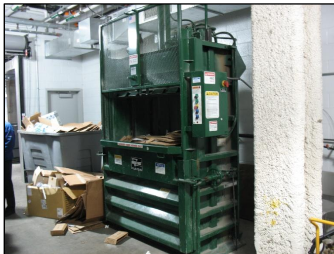
Cardboard baler in utility room adjacent to loading dock.

Most new sports venues have dedicated space for recycling equipment such as a baler or compactor as well as storage areas for cardboard bales and staging areas for full containers or gondolas prior to pick up. However, space is the primary limiting factor in many facilities which were not designed for integration of recycling. Normally, additional space is required adjacent to a loading dock or storage area on the ground floor of the facility. In addition, an electrical connection for baling or compacting equipment is necessary. In existing buildings, adding recycling may require additional capital costs not only for equipment, but for the space and utilities to operate these activities.