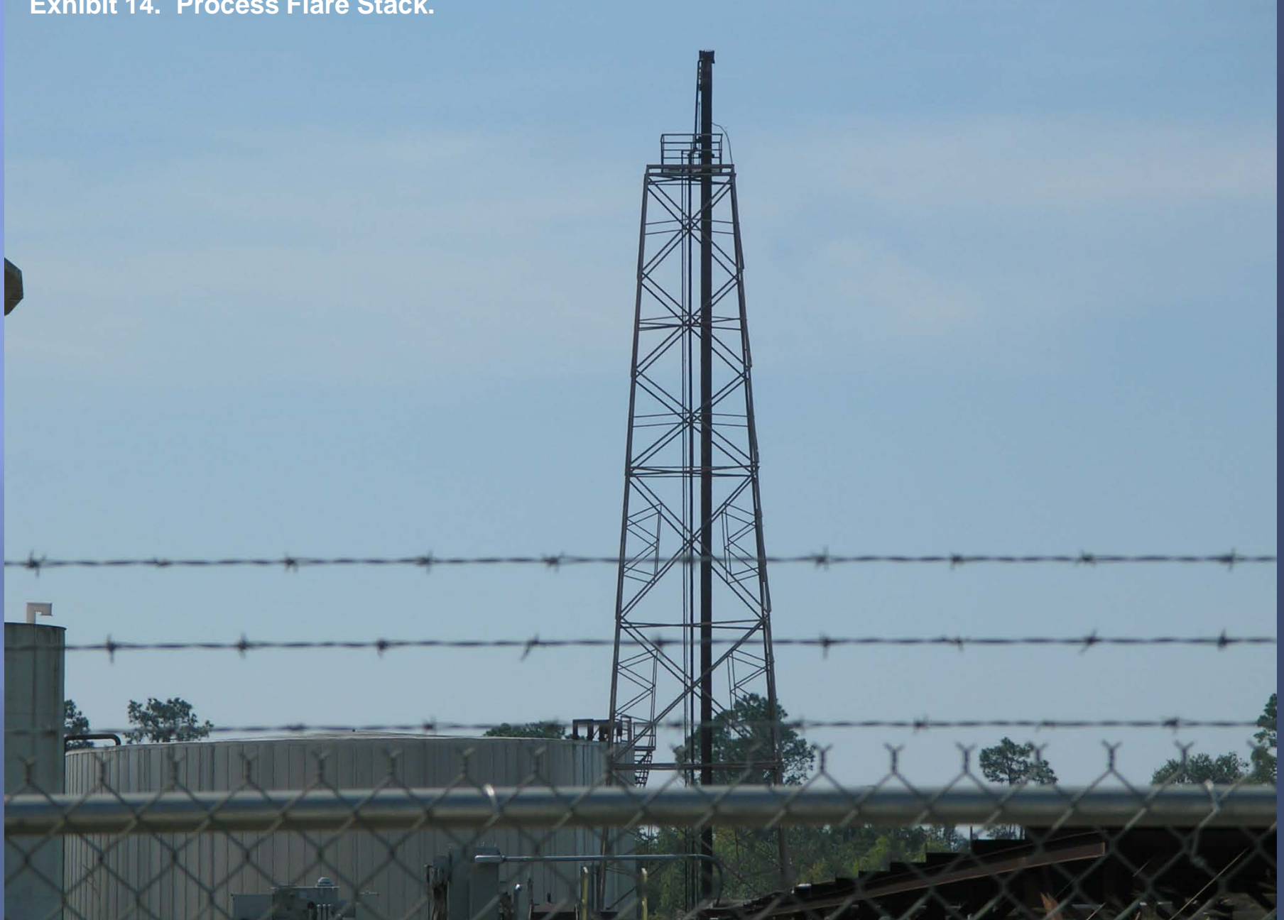
Exhibit 14. Process Flare Stack.