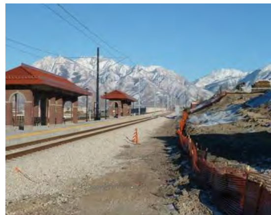
A Utah Transit Authority light rail station opened in 2011 and is another example of mixed-use redevelopment at the site.

EPA was able to satisfy its enforcement priorities while coordinating with the goals and interests of the community, site owners, and other stakeholders so as not to serve as an impediment to the reuse of the site. Enforcement tools such as the 2004 consent decree with Littleson and the Superfund program's remedial process detailed information provided site to inform redevelopment. By learning lessons from the failure to anticipate long-term stewardship and site redevelopment at the Sharon Steel site, the Midvale Slag site was able to succeed and now serves as a shining example of how EPA's enforcement tools can play an important role in revitalizing contaminated properties.