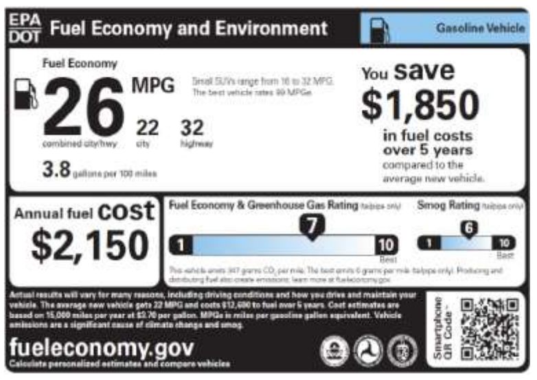
Figure 1: A sample gasoline fuel economy and environment label. Source: http://www.epa.gov/otag/carlabel/

Annual fuel cost —The estimated fuel cost for a year, based on the assumptions in the fine print: cost is based on 15,000 miles per year at $3.70 per gallon.