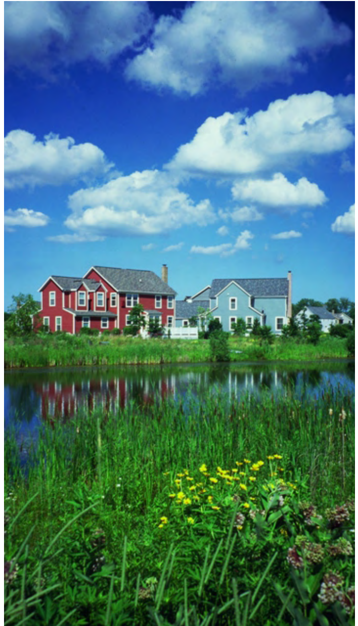
Cluster development can help a rural community transition between town and countryside. Prairie Crossing in Grayslake, Illinois, clustered homes to protect a large swath of prairie. The community includes a station on a rail line that goes to Chicago, a working farm, historic community buildings, and energy-efficient new homes.

Cluster developments work best where towns transition to true rural areas with active agricultural or livestock operations and large contiguous natural areas. In transition areas, the developed cluster can be adjacent to existing development on the edge of town, with the open space acting as a transition or buffer that separates the development from undeveloped areas. This approach can work as long as extensive additional growth is not expected; otherwise, that additional growth could leapfrog to the other side of the cluster buffer with limited connections to the town.