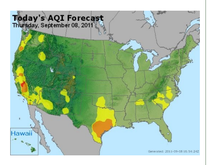
Daily air quality forecast map, available on airnow.gov.

Breathing ozone can trigger a variety of health problems including asthma attacks and other respiratory problems -chest pain, coughing, throat irritation, and congestion. Repeated exposure may permanently scar lung tissue.