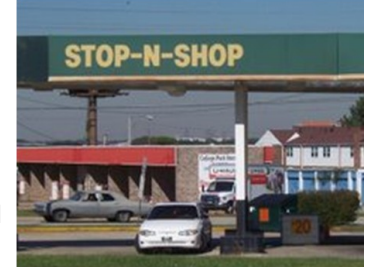
Vehicle emissions testing facility.

Their procedure was to connect cars they knew would pass the test to emissions equipment instead of connecting the equipment to the owners' real cars. During the tests, the computer system automatically transmitted emissions testing data to a statewide database accessible by the Georgia Environmental Protection Division. False information was entered into the system, such as the make, model, and vehicle identification number, to make it appear those owners' real cars, many of which had already failed an emissions test or showed equipment malfunctions,