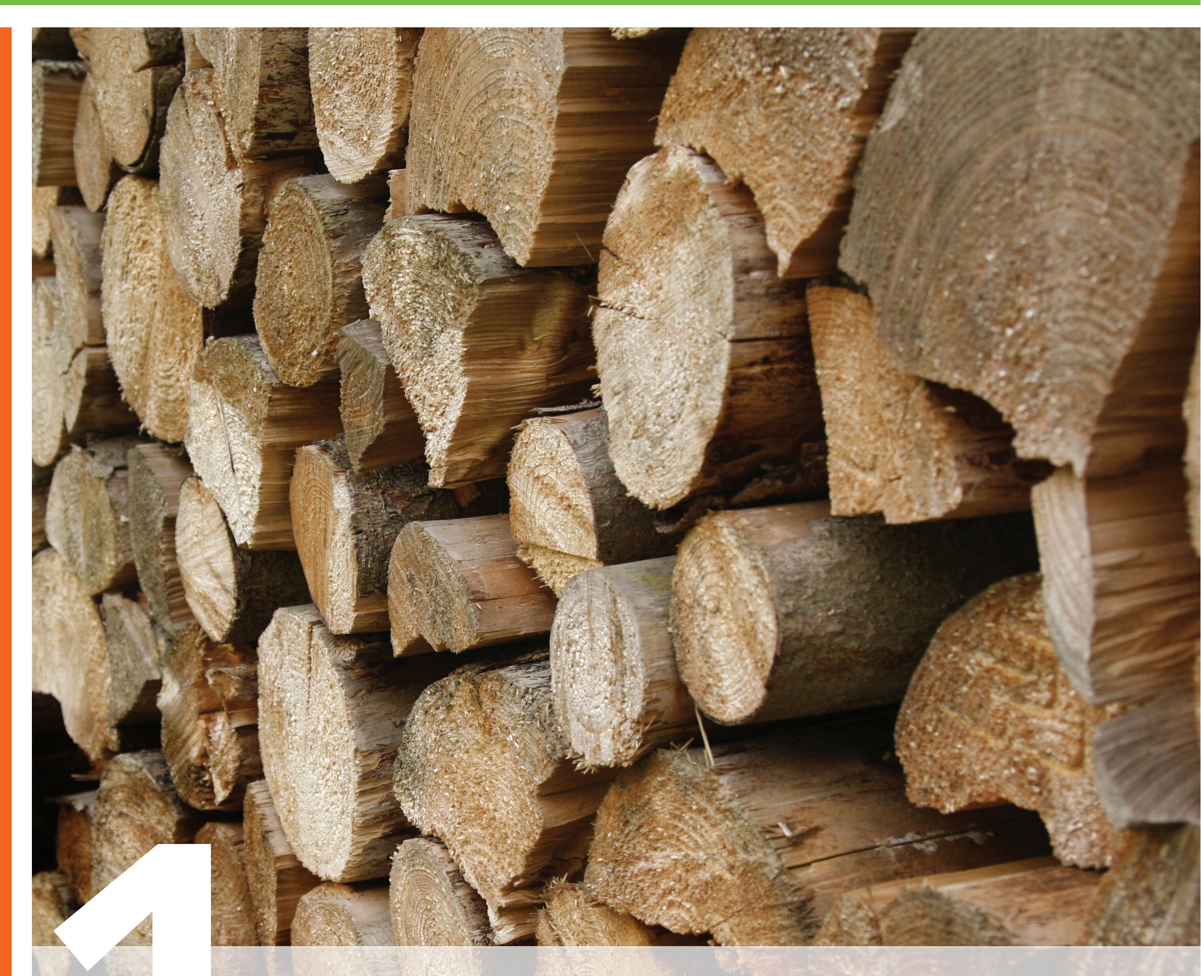
Save money and time. Burn only dry, seasoned wood and maintain a hot fire.

Burn the right wood, the right way, in the right appliance