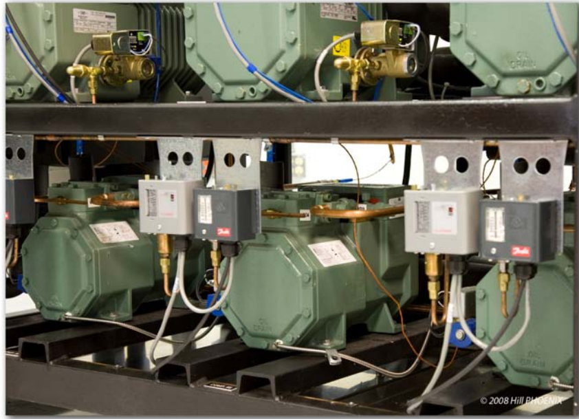
CO 2 Compressors on the SNLTX 2 Cascade System

But Price Chopper was looking for further innovations in its efforts to reduce energy consumption. In fact, says Martin, Price Chopper specified several innovations including “high-efficiency ECM fan motors and LED lighting in all cases, the use of reach-in door cases for all new medium-temperature loads, and variable-speed fan control for the air-cooled condensers. That quest for innovation is what ultimately led them to use our next generation SNLTX 2 low temperature refrigeration system.”