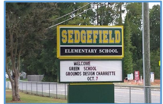
Sign announces special forum – the Green School Grounds Design Charrette.

U.S. Environmental Protection Agency EPA Region 3 Water Protection Division Philadelphia, PA