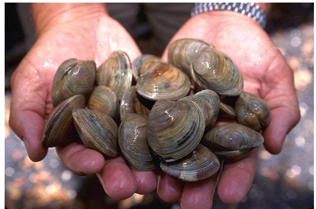
Hard clam ( Mercenaria mercenaria ). (Image of USDA via LeaMaimone, Wikimedia Commons )

The partial pressure of carbon dioxide ( p\text{CO}_2 ) is increasing in the oceans and causing changes in seawater pH. This is commonly described as ocean or coastal acidification. When reproduced in laboratory experiments, these increases in p\text{CO}_2 can reduce survival and growth of early life stage bivalves. However, the ways that these impairments translate to effects on whole populations of bivalves are unknown. In this study, laboratory responses were incorporated into field-parameterized population models to assess population-level sensitivities to acidification for two northeast bivalve species with different life histories: Mercenaria mercenaria (hard clam) and Argopecten irradians (bay scallop). The resulting