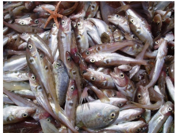
Young-of-the-year haddock

To characterize potential risks that ocean warming may pose to marine fish and invertebrates, the researchers identified factors influencing species resilience. This research could help fisheries scientists' better plan for the effects of ocean warming when developing management measures.