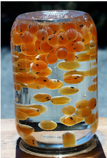
Winter-run Chinook salmon embryos in their egg capsules.

Scientists closely tracking the survival of endangered Sacramento River salmon faced a puzzle: the same high temperatures that salmon eggs survived in the laboratory appeared to kill many of the eggs in the river.