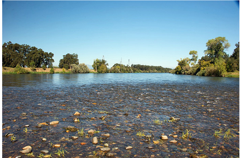
Water flowing over a gravel riffle in the Sacramento River.

External temperatures govern the biological processes of salmon eggs and the embryos inside. As the water gets warmer their metabolism increases, demanding more and more oxygen. Unlike juvenile and adult fish, eggs cannot move and don't have a developed respiratory or circulatory system. Instead they rely on flowing water to supply oxygen and carry away waste products.