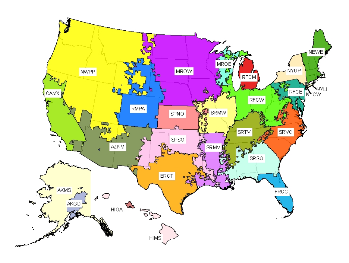
Figure B-1. eGRID Subregion Representational Map

This is a representational map; many of the boundaries shown on this map are approximate because they are based on companies, not on strict geographical boundaries.