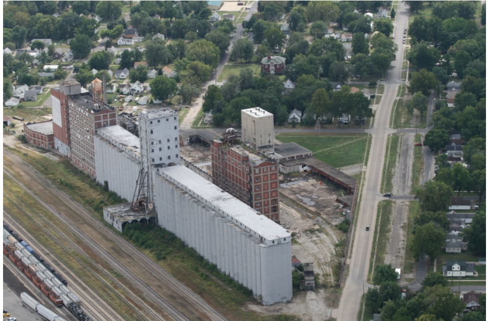
The Pillsbury Mills facility as it looks today.

Site-related documents may also be viewed at the Lincoln Library.