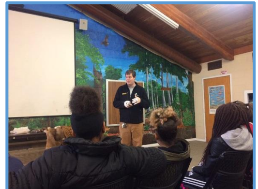
Naturalist at Potomac Overlook Regional Park speaks to students participating in the Saturday Environmental Academy.

U.S. Environmental Protection Agency EPA Region 3 Water Protection Division Philadelphia, PA