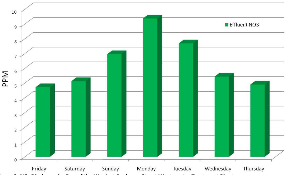
Figure 2. NO<sub>3</sub> Discharge by Day of the Week at Buckman Street Wastewater Treatment Plant

In the "Define" phase of the project, after studying 67 weeks of data, JEA observed that nitrogen discharge was always at its lowest level on Friday evening and rose each weekend to reach a peak level on Monday morning, and then subsequently declined throughout the week. This pattern negatively affected monthly nitrogen totals reported to the Florida Department of Environmental Protection.