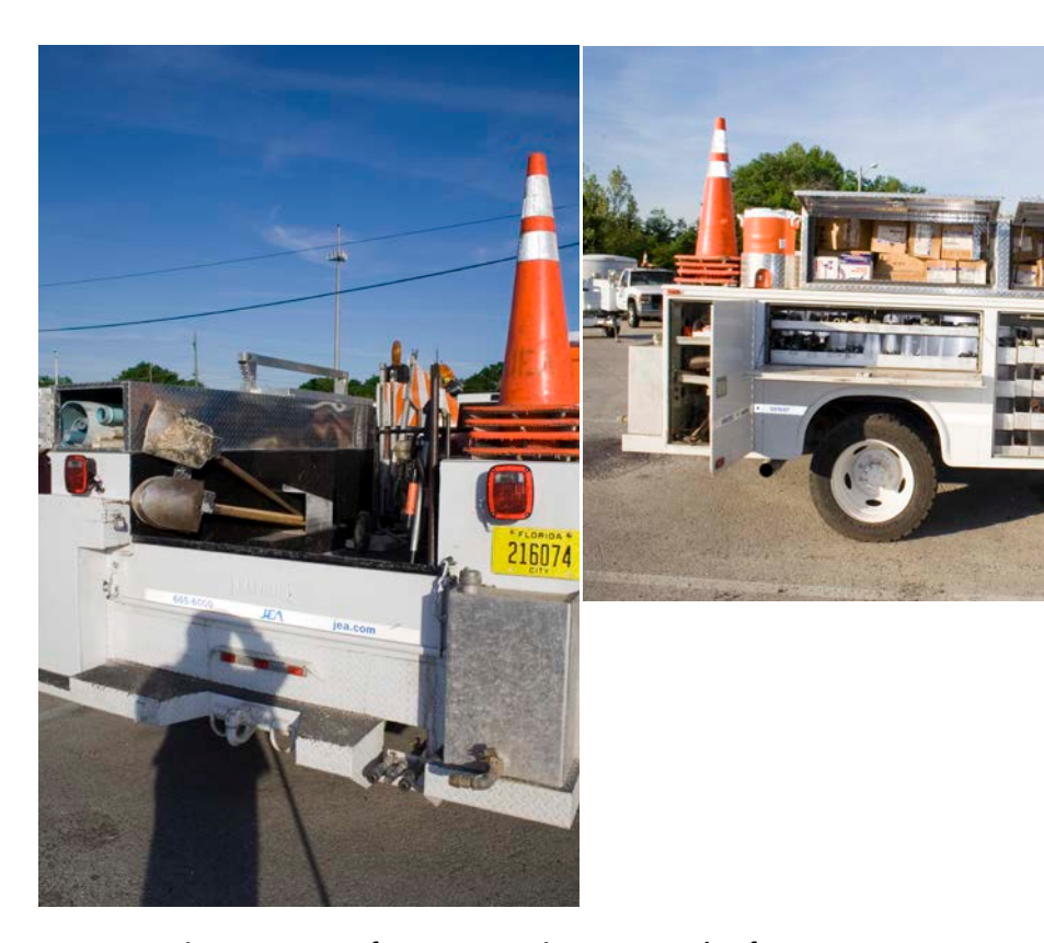
Figure 4: Water Infrastructure Maintenance Trucks After Lean Improvements

The team also created a plan to ensure that the new system would be sustained, which contained the following steps: