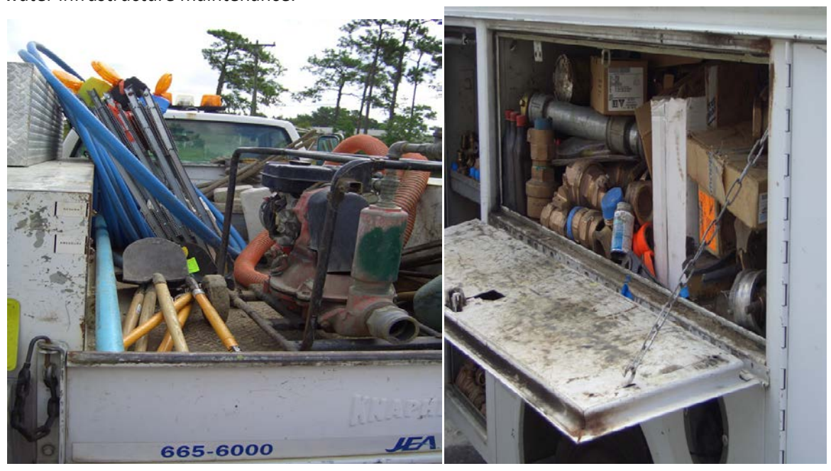
Figure 3: Water Infrastructure Maintenance Trucks Before Lean Improvements

Within JEA's DMAGIC framework for Lean Six Sigma projects, the project team studied the process, using tools such as Pareto charts, X-Y matrix, direct process observations, root-cause analysis, and "five whys" questioning, and concluded that the top two factors leading to increased time were material being difficult to locate on the truck and material being difficult to get off of the truck. To address these concerns, the team used the Lean method of 5S to organize and standardize the materials on the trucks. 5S is a five-step process (Sort, Set in order, Shine, Standardize, and Sustain) designed to create and maintain a clean, neat, and orderly workplace. Through 5S, the team developed a standard system for configuring the bins and materials on trucks (allowing some regional variation in the quantities of materials), including labels and magnetic signs for bins and compartment doors, and notebooks with pictures and descriptions of each item. This standard system was implemented on all trucks used for water infrastructure maintenance.