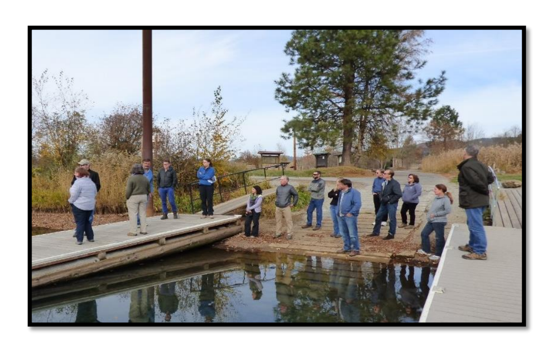
Wetland in the Lower Basin Site